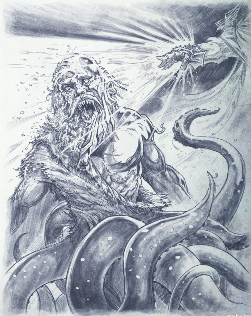
Art by Scott Paine

You claim protection in the name of the river god, and the creatures of the river take heed. While this Miracle is active, no aquatic creature can come within Willpower Bonus Yards of you or do anything to attack you.