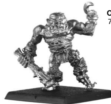
Ogre Pit Fighter 74601/8 – £6.00