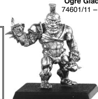
Ogre Gladiator 74601/11 – £6.00