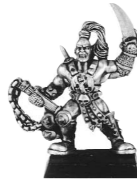
Pit Fighter 079901601 – £4.00