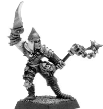
Mordheim Pit Fighter 110203001 – £4.00