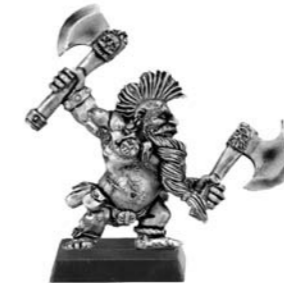
Trollslayer 110500101 – £4.00