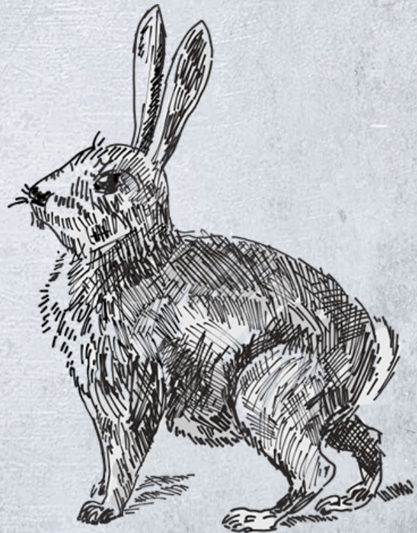
The cook at the crossroads

The Eason family are dominated completely and have no choice but to obey the will of the fey. The fey is unable to have them commit violence, but they will help the Cook in any other way. After the Cook is defeated the spell breaks and the family continues to be completely unaware of anything untoward that has happened. Some player Characters may take pity on the Easons while others may not.