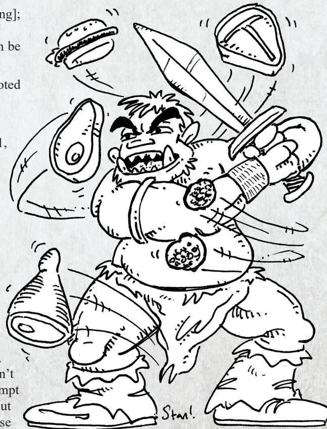
Misinterpretation of Meatier Swarm

This spell functions like summon swarm , but the swarm you summon has twice as many hit points as normal and the DCs of all of its abilities (distraction, poison, etc.) are increased by 2.