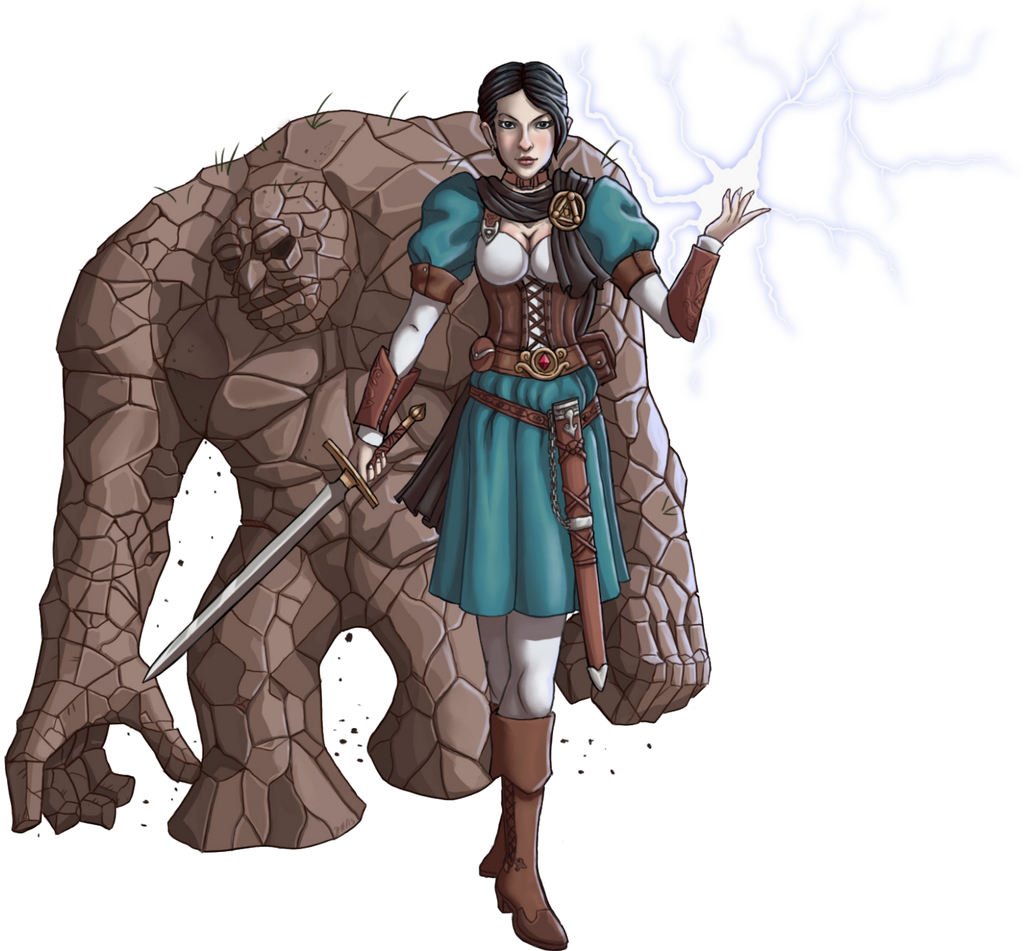
T'nath'n, Twelfth Sword Arcanist