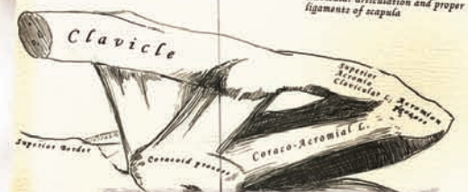
fig. 154 - Left Shoulder joint, scapulo-clavicular articulation and proper ligaments of scapula