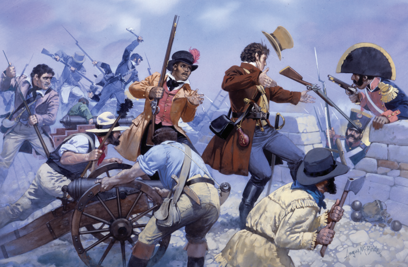
The death of William Barret Travis by Angus McBride