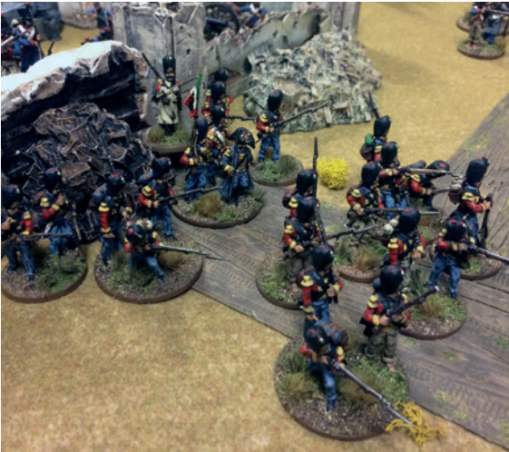
Mexican Grenadiers at Alamo. Converted from Victrix Miniatures.