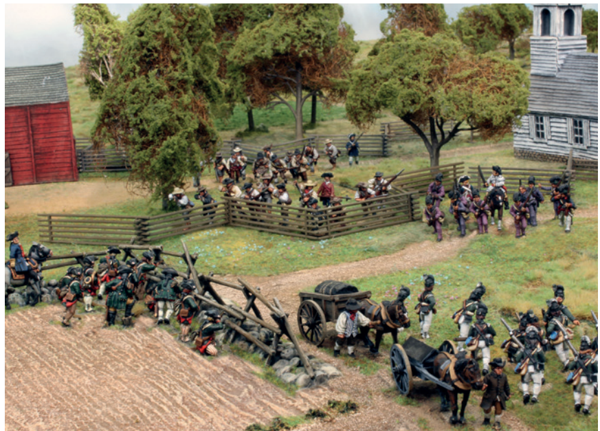
Hessian Light Infantry and Loyalist Light Infantry cover the British supply wagons from the American militia and Lee's Legion. American War of Independence. Miniatures by Perry Miniatures.