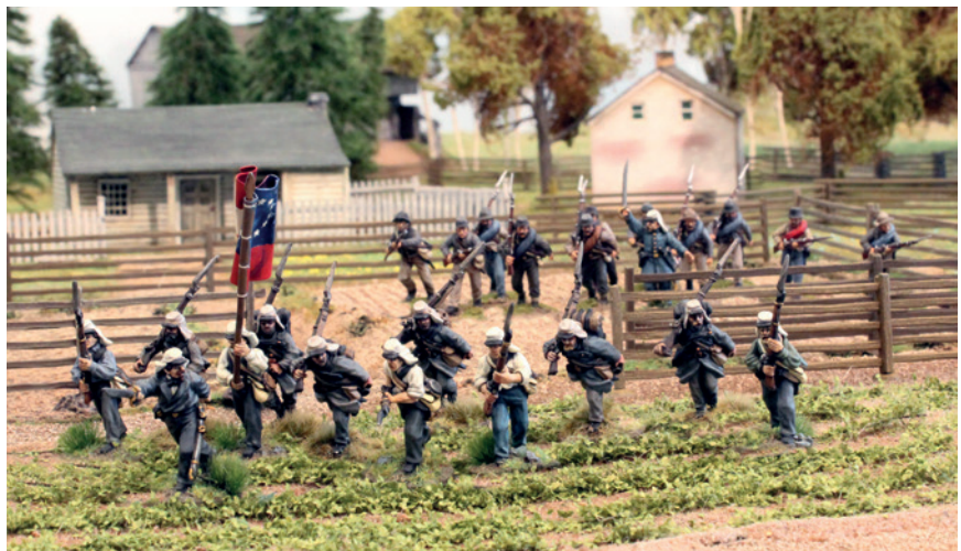
Two units of Confederate Light Infantry advancing. American Civil War. Miniatures by Perry Miniatures.

As with our previous rules, we've focused on the overall 'feel' and 'flow' of the game, rather than worrying ourselves about the minutiae of historical simulation. Our design goal has been to write an enjoyable set of broad-brushstroke rules that reflect small-unit warfare in this period without getting bogged down in too much detail or too many rules (if one thing in life is certain, it's that neither of us will ever remember too many rules!). At the same time, the rules play up the feeling of adventure, where heroic officers lead their men to glory... did someone say, "Hollywood"? Alongside the easy-to-understand battle rules, Rebels and Patriots presents a varied selection of scenarios. This means that you can concentrate on