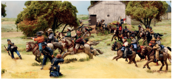
Confederate Bushwhackers. Miniatures by Perry Miniatures.