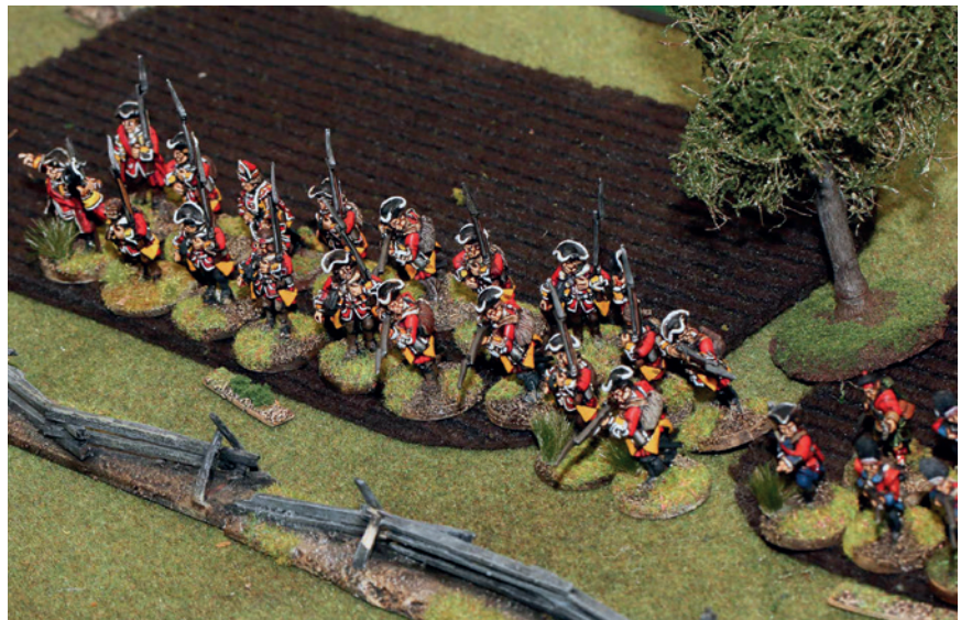
A Large Line Infantry unit in Close Order. French Indian War. Painted by Jesper Ohlsson. © Pål Nordblad