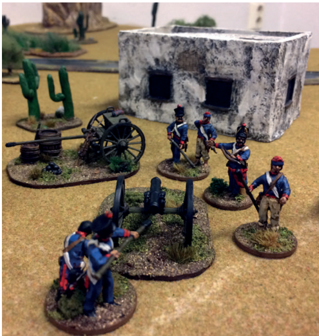
Mexican Artillery with the Limber option. Mexican-American War. Converted from Perry Miniatures and Victrix Miniatures.

Light Cavalry represent all kinds of regular cavalry (such as light dragoons, Mexican Presidials , Union and Confederate cavalry) as well as all kinds of irregular forces (mounted militia, bushwhackers, and guerrillas, etc.). If they're sitting on a horse, they're most likely to be Light Cavalry in Rebels and Patriots ! If you want your cavalry to fight dismounted, please use the Mounted Skirmisher troop type to represent that tactic.