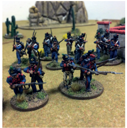
Mexican Skirmishers cover a unit of Line Infantry, so they can't be fired upon by the enemy. Converted from Perry Miniatures and Victrix Miniatures.