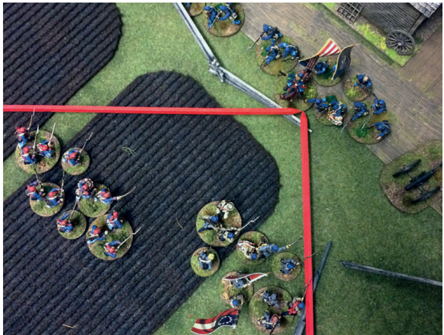
The arc of fire and movement for infantry in Close Order formation. Miniatures by Perry Miniatures. © Michael Leck