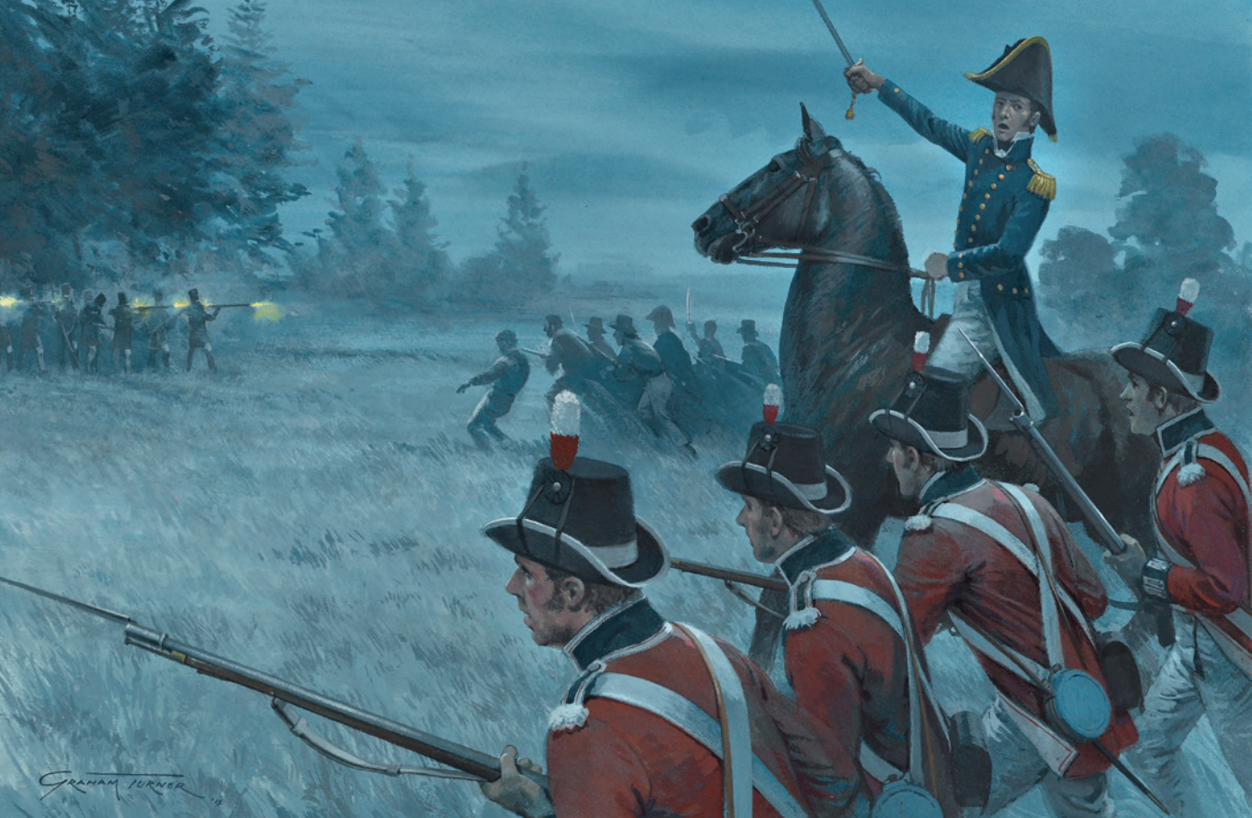
The British assault onto Caulk's Field, August 31, 1814 by Graham Turner © Osprey Publishing. Taken from Campaign 259: The Chesapeake Campaigns 1813–15