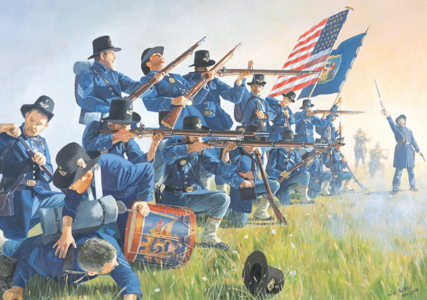
The Iron Brigade. Taken from Campaign 95: Second Manassas 1862