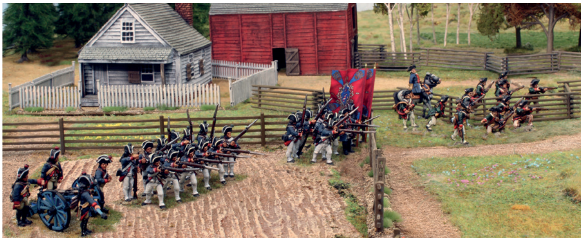
Hessian mercenary's Light Artillery, 2 units of Line Infantry and Light Infantry. American War of Independence. Miniatures by Perry Miniatures.