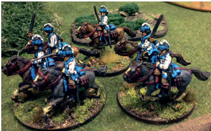
Continental Light Dragoons would most often be fielded as a unit of Light Cavalry, but the same miniatures might be used to field a Small unit of Shock Cavalry, to depict an Officer using his Light Dragoons in a very offensive way during the game. American War of independence. Miniatures by Wargames Foundry.