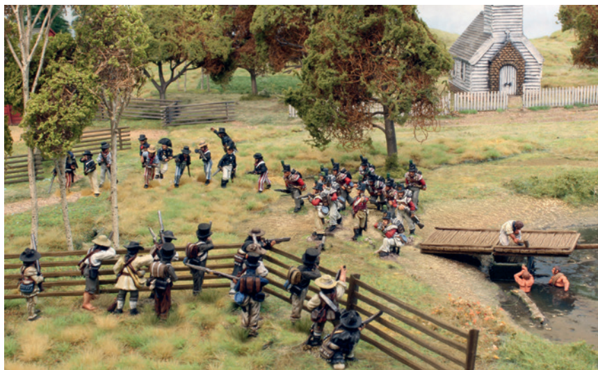
British sailors and Line Infantry defending the bridge build against American Militia. War of 1812. Miniatures by Perry Miniatures.