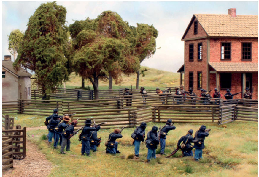
American Civil War. Miniatures by Perry Miniatures. © Alan and Michael Perry

A well-drilled unit could, at its best, fire 2 or 3 rounds each minute, so these massed formations were essential to maximizing the effect of the short-ranged muskets used. To be able to dish out the carnage required to break and rout an enemy formation, units had to keep in close order, march forward towards the enemy's line, and hopefully deliver the all-important first volley at close range and thereby win the day.