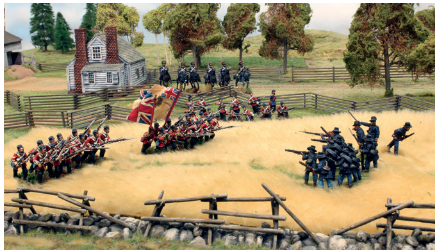
British/Canadian fighting American Line Infantry during a “What-if” British Intervention Force in North America game. Miniatures by Perry Miniatures.