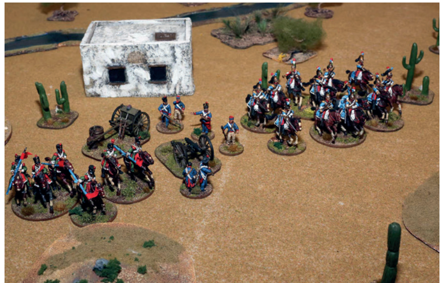
Mexican Light Cavalry with Aggressive option (Lancers), Artillery with Limber option, and Shock Cavalry. Converted from Perry Miniatures and Victrix Miniatures. © Pål Nordblad