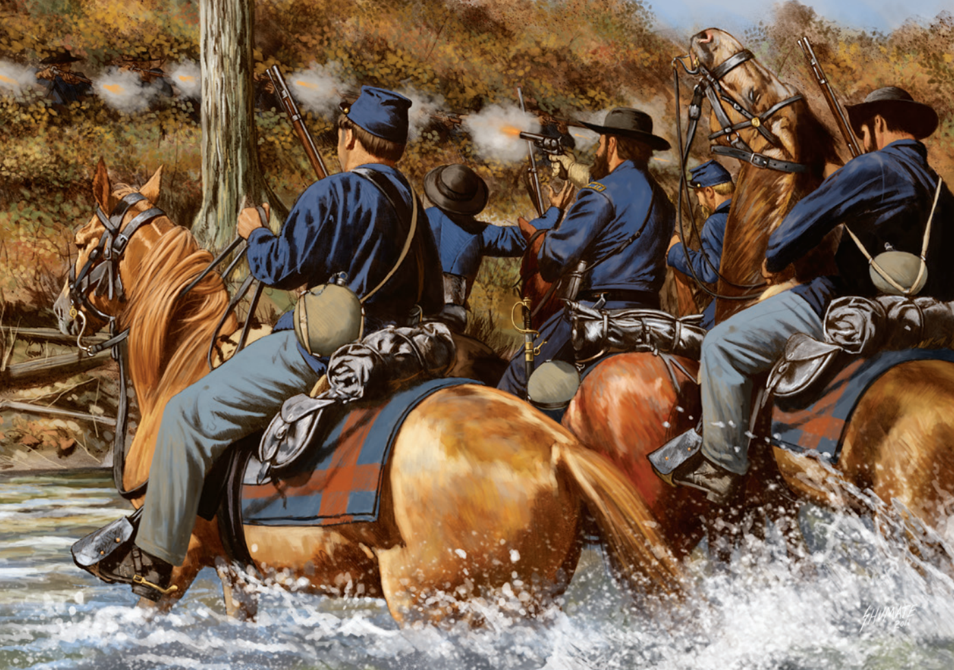
The trap at Dug Ford, October 12, 1863. Taken from Raid 25: Ride Around Missouri