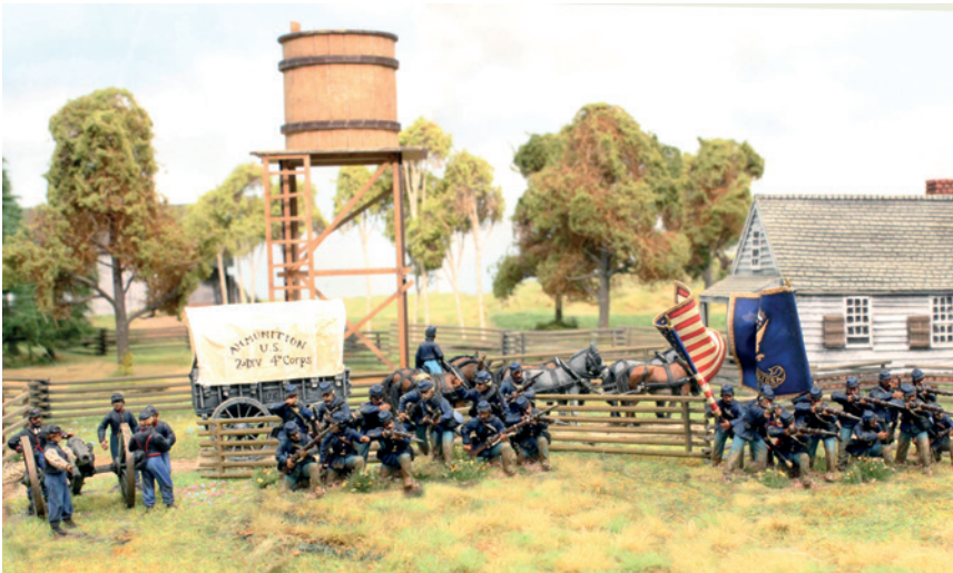
Union units of Line Infantry form up in Close Order to support the Medium Artillery. American Civil War. Miniatures by Perry Miniatures. © Alan and Michael Perry