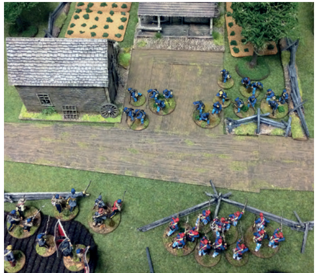
The two Confederate Line Infantry units in the lower part of the picture both have Cover due more than half of the units' models behind the fence. The Union Line Infantry unit (top right) also has Cover. The top left Union Skirmisher unit also has Cover because all Skirmish units count Open Ground as Cover from Firing. Miniatures by Perry Miniatures.