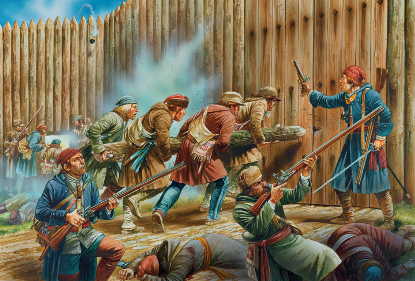
Assault on Fort Bull, March 27, 1756. Taken from Raid 46: Montcalm's Crushing Blow