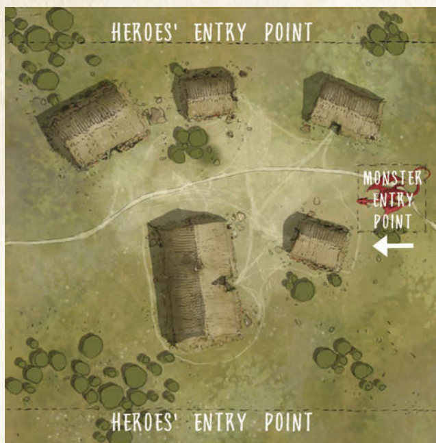
Map for Save Fayrhill Village.

passed over our peaceful village. Gatherin' what pieces of my life I could carry, I ran and ran. I did think of those who I had not seen run by me, and knew it was probably too late."