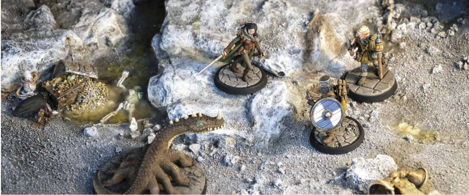
The Basilisk. Perhaps not as scary as a Landwyrm , but just as deadly.

er can be a knight or mercenary captain. The rest of the board should be fairly open on one side (cleared by the defenders to give a better view of the area) and mixed on the other side, with the occasional wood or ruins (probably the remains of previous watchtowers!). The warbands are set up opposite the monster entry point.