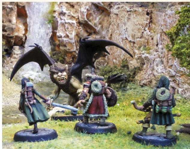
Beware the evil Manticore!

The Landwyrn casts Elemental Bolt on an 6+. It takes no damage for a miscast. The creature has flame resistance (+5 versus all elemental Fire attacks). It attacks twice to the front (claw, bite) and once to the rear (tail lash).