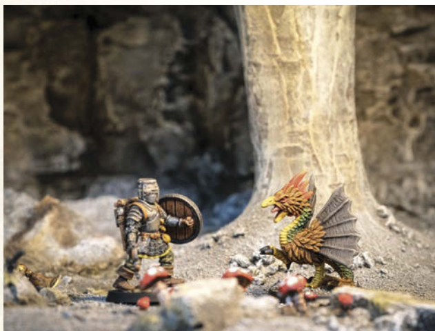
There's nothing worse than a cockatrice!

The Rock Golem is a construct, but it cannot be controlled by any wizard. It attacks twice to the front (punch, punch). Each punch attack causes triple damage. The Rock Golem has no flaws.