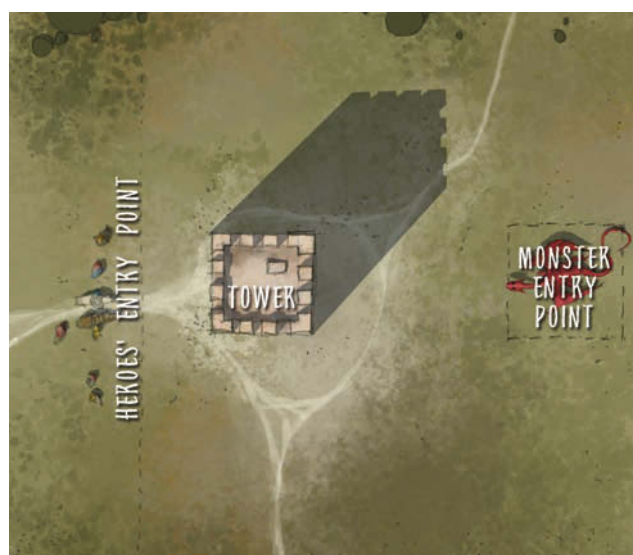
Map for Sentinel's Watch.

The warning beacons are ablaze and the bells ring out from every village. A monster is heading into civilized lands and the warband are the only ones close enough to stop it. Should they fail, many hundreds of innocent people may be killed, never mind the loss