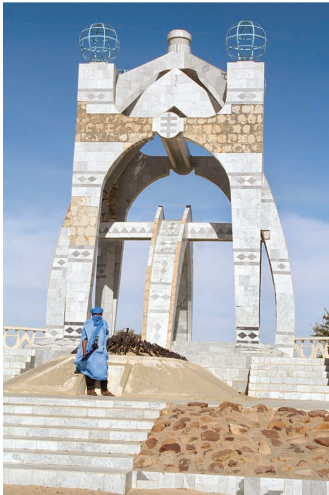
A Targui (singular for Tuareg) stands beside surrendered guns set in cement as part of this monument to commemorate the end of the Tuareg revolt in 1995.

(an administrative system with many layers and functions in which most of the important decisions are made by appointed officials). This bureaucracy was characterized by corruption, inefficiency, and mismanagement.