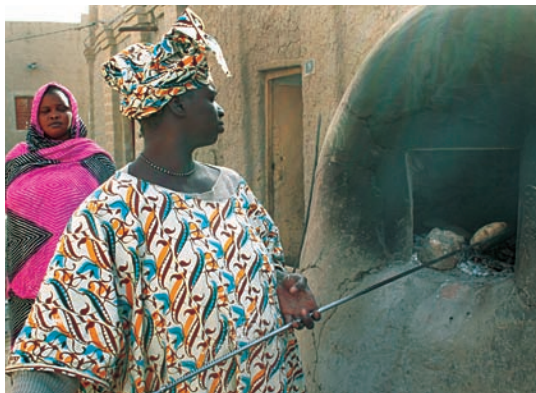
Early every morning in the streets of Timbuktu, Songhay women bake delicious loaves of bread in clay ovens.

The Sahara Desert, which once brought profitable commerce to Timbuktu, has now become a threat to the city's survival. Drifting sand blown by the dry seasonal wind called the harmattan threatens to smother some neighborhoods. The expansion of the desert has already destroyed vegetation