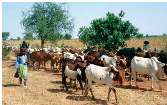
Nomadic Fula herd their Zebu cattle to market.

Zebu cattle were probably introduced from India. They are used primarily for milk production and are only rarely eaten for their meat. They are also sometimes used to carry heavy loads or for riding. These cattle cannot survive in the rainforest regions to the south of the savanna, because the forests are infested with tsetse flies. Tsetse flies are