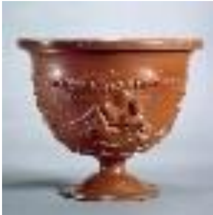
Goblet of Pegas