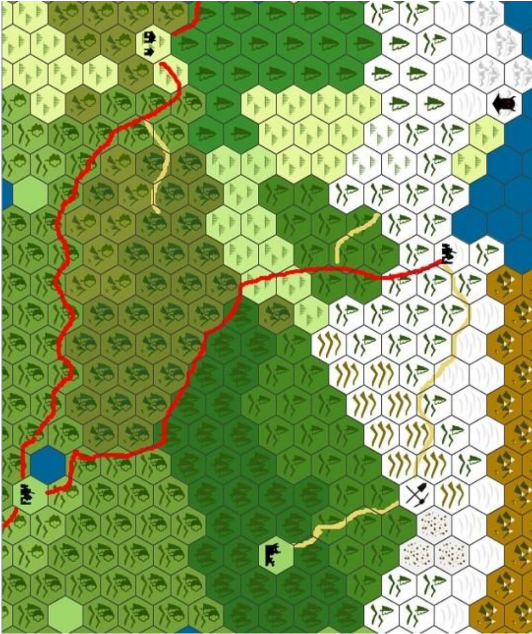
Player's Area Map (available in Upton)