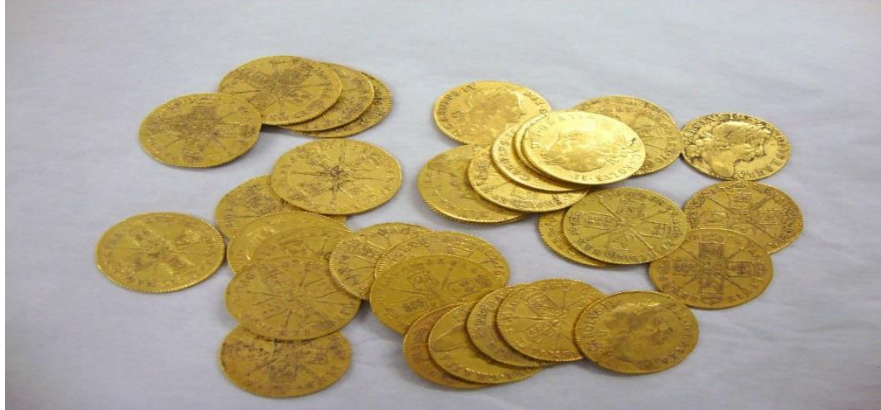
Magels (gold pieces)