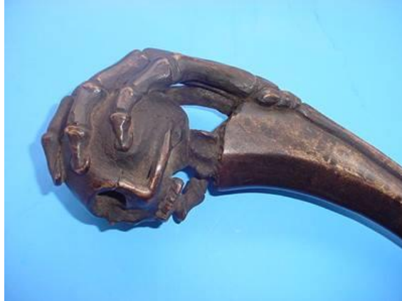
Cudgel of Resurrection & Animation