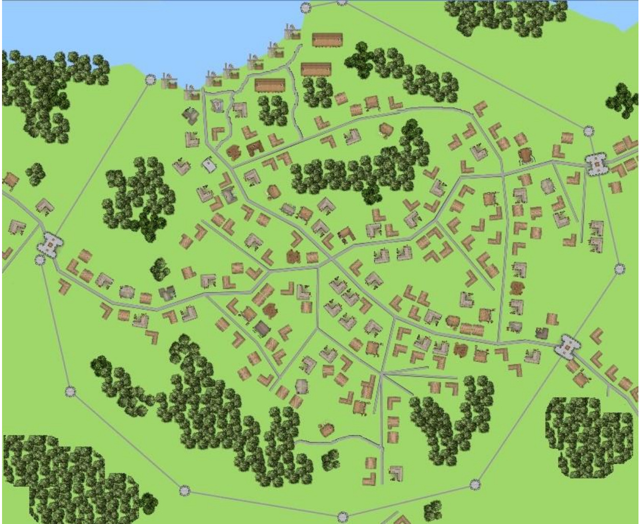
Queen's Point in Provincia