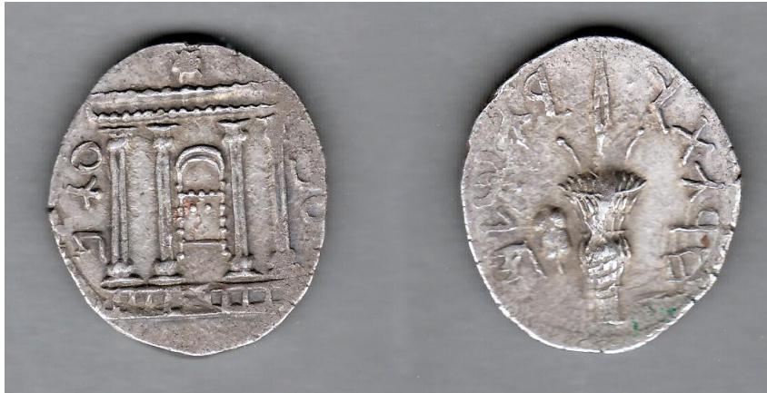
Timbur (silver pieces)