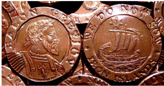
Kalecs (copper pieces)