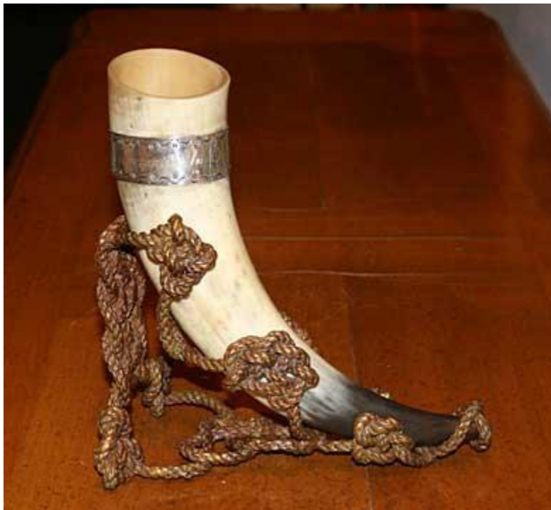
Horn of Jelly