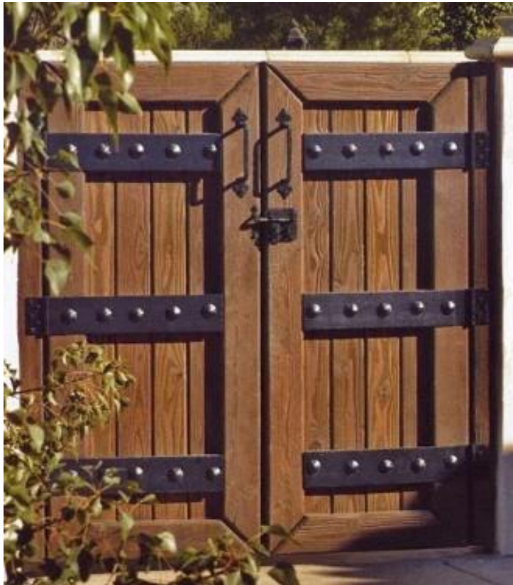
Gates of Timel

Welcome to the Whisky Fisher Today's Menu Breakfast Kippers Goose eggs Griffin-milk cheese Sea-grapes Corn pone 3sp Lunch Sausage Sharp cheese Green beans Currants 4sp Supper Mixed grill Turnips Okra Rice Plum pudding 5sp Snack Curds Stewed prunes Tahini 2sp