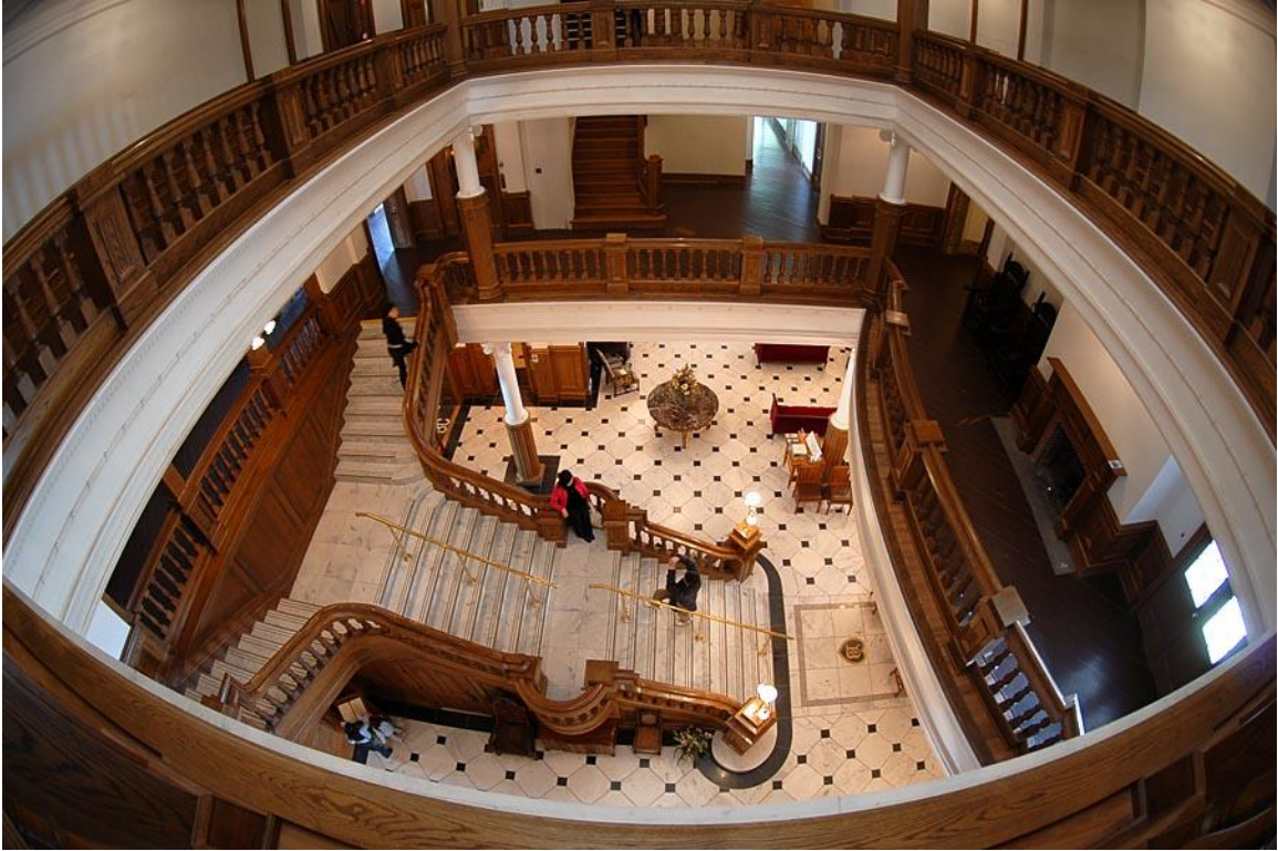
The Grand Staircase <above> and the Chapel <below>