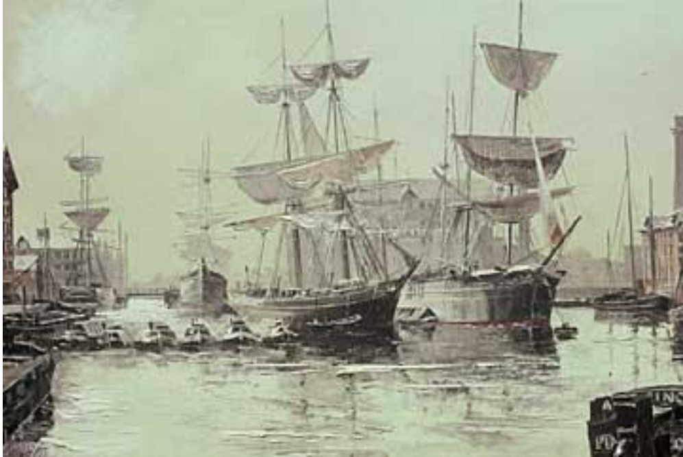
Wharf area <above> and Sections I/J <below>