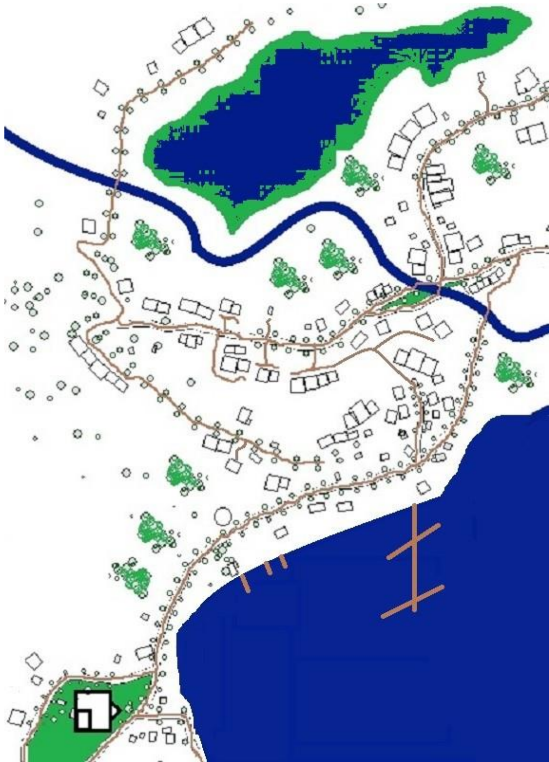
Player's Map of Kak