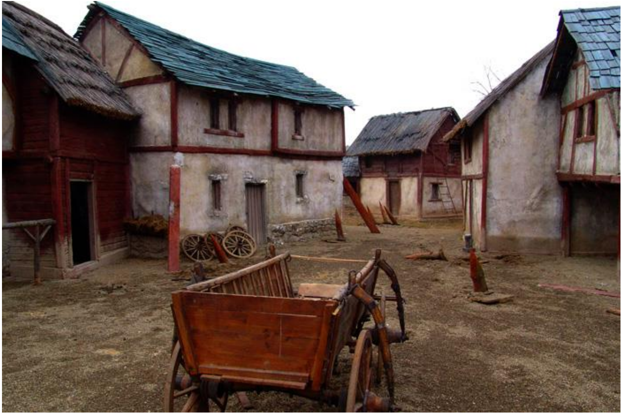
Areas 7 – 12 shown here