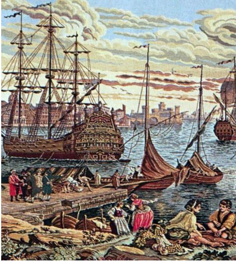
Dock section <above> Naval District <below>