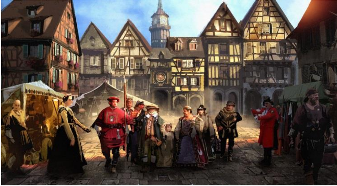
Wealthy District <above> and Craftsmen District <below>