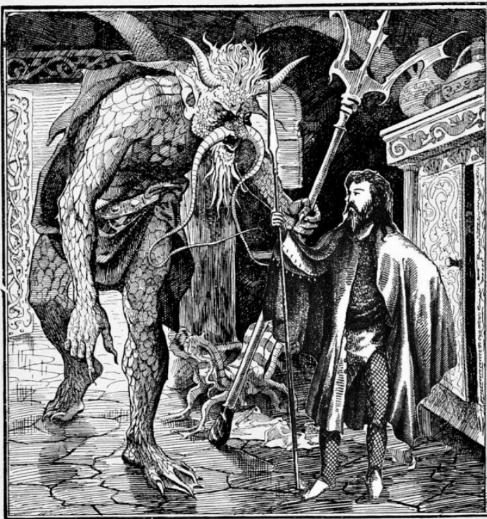
Azon the Ravenous

Demon, Ashtarath the Bright: HD 11; AC -1[20]; Atk 2 claws (1d4), 1 bite (1d6+2); Move 9 (Fly 14); Save 4; CL/XP 13/2300; Special: +1 or better magic weapon needed to hit, magic resistance (65%), +2 on to-hit rolls, immune to fire, magical abilities.