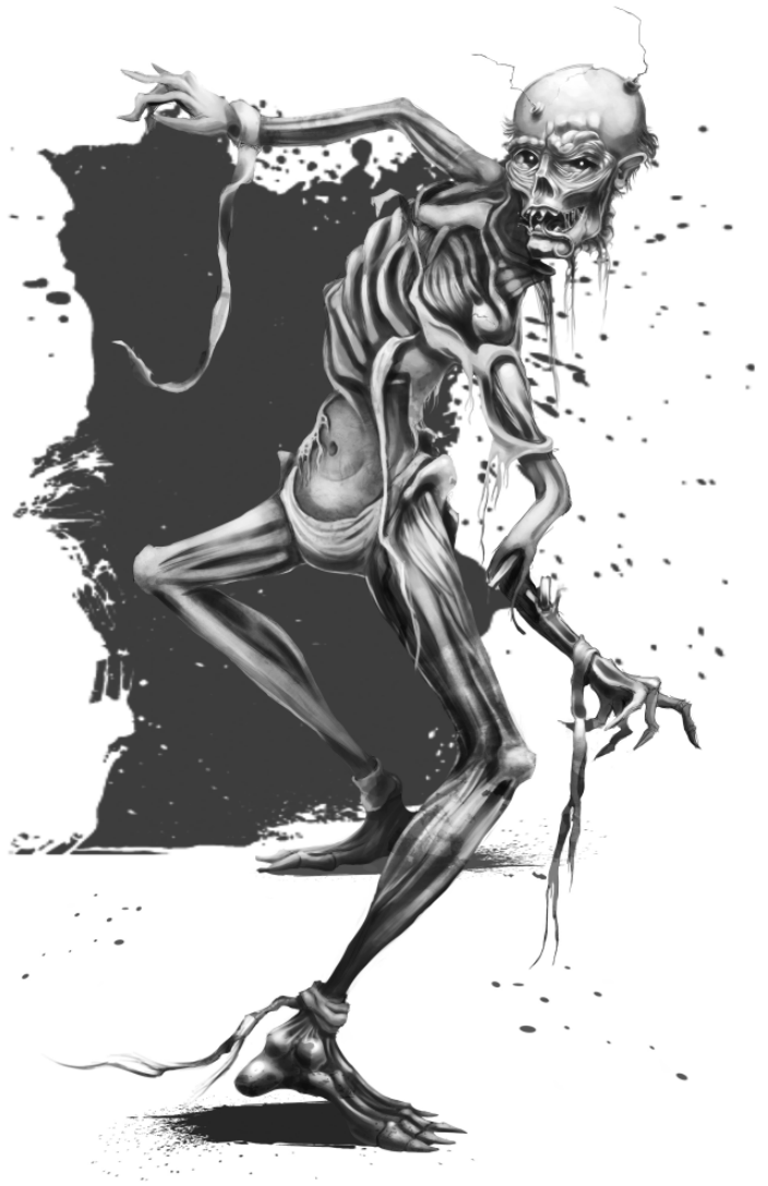
Complete, pg 59)

HADEN CRESTINGDRAKE: HD 6; HP: 31; AC -1[20]; Atk 2 claws (1d8 + blood consumption); Move 12; Save 11; CL/XP 12/2000; Special: Blood consumption, horrific appearance, +1 or better weapon to hit, magic resistance (10%), bloodstorm 3/day (See Sidebar). (The Tome of Horrors