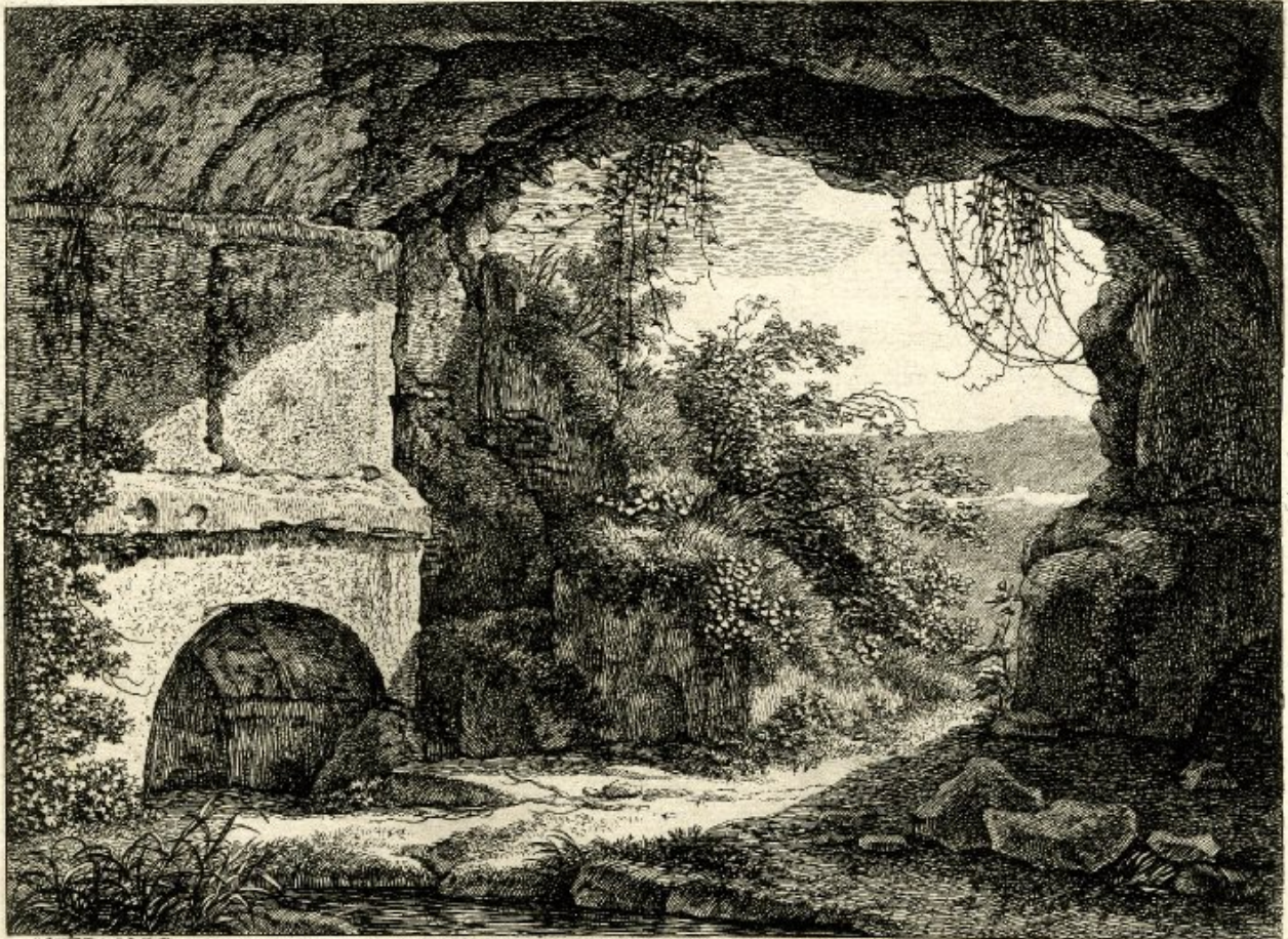
INTERIORE DEL SEPOLCRO DELLA FAMIGLIA DE NASONI sulla strada. De Terni

"Interior of the mausoleum of the Nasoni family," The British Museum