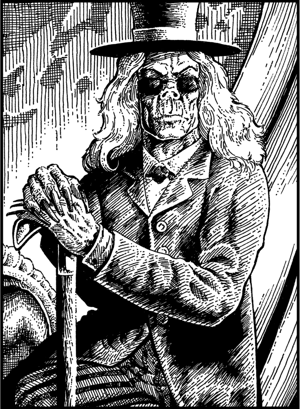
An Ancient Vampire dressed up for a night on the town.