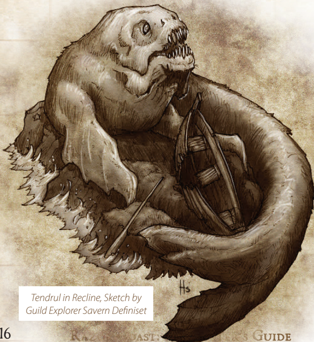
Tendril in Recline, Sketch by Guild Explorer Savern Definiset

Improvised Crafting: You can make functional items from what others consider junk. This includes armor, basic tools, clothing, waveboards, and weapons. Whenever you