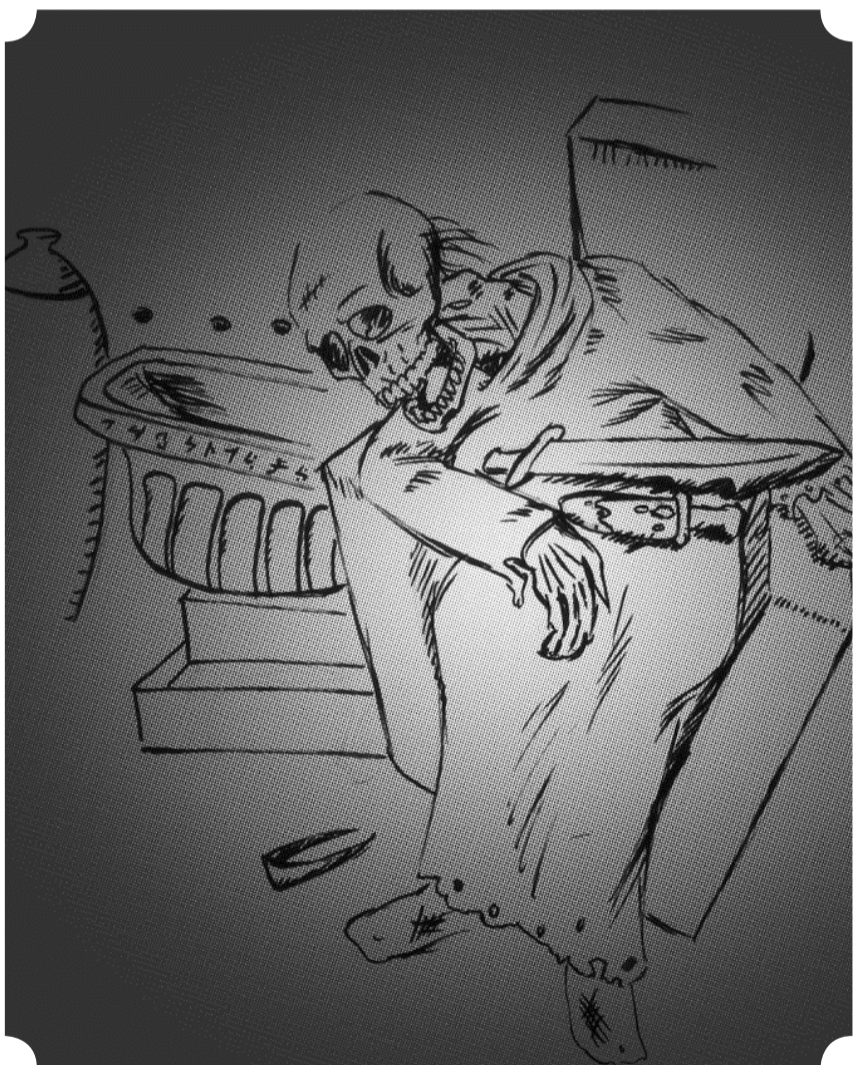
Corpse King by Claytonian JP

This room is as Room 11, with 5 more Carls.