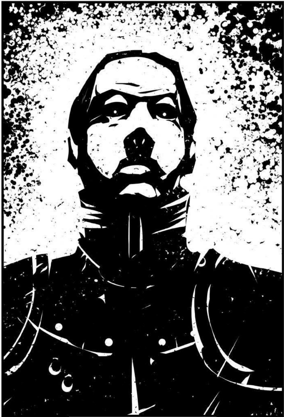
• MARIANA TRENCH •