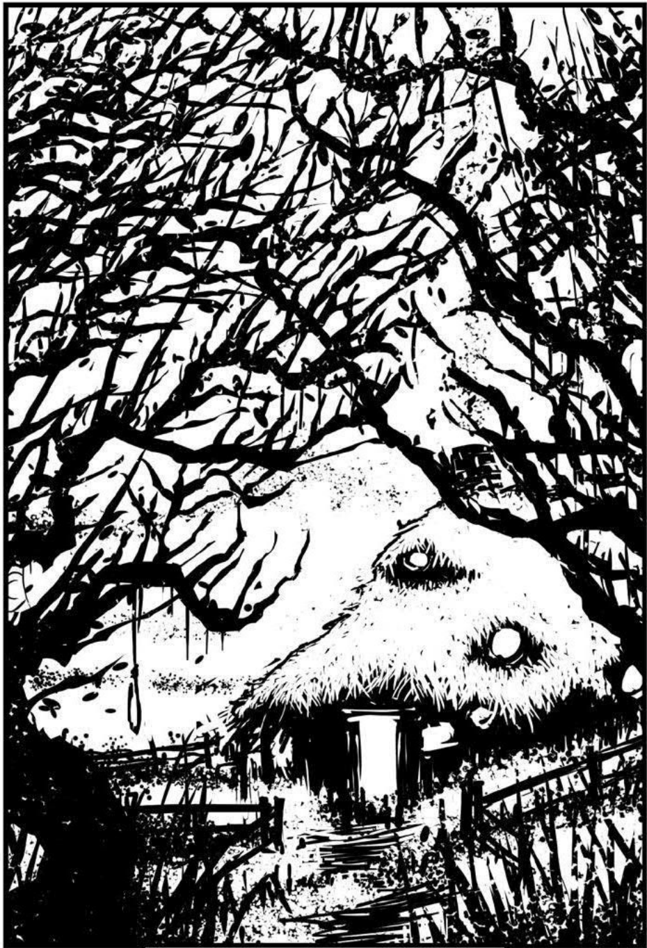
• THE NAME DROP INN •