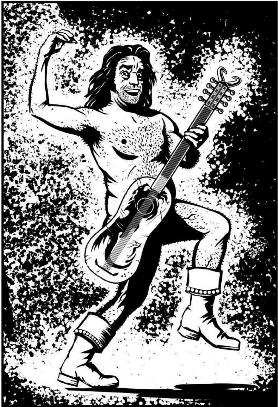
• BLACKIE RITCHMORE •