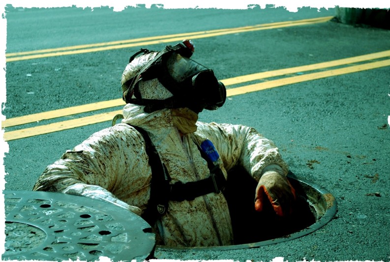
Table 5: The Explorer

Explorers, unlike other members of the occult underground, lack familiarity with weapons. Weapons wielded by an explorer do a dice size of damage less. (for example, a shotgun normally does d10 damage, but in the hands of an explorer only does d8).