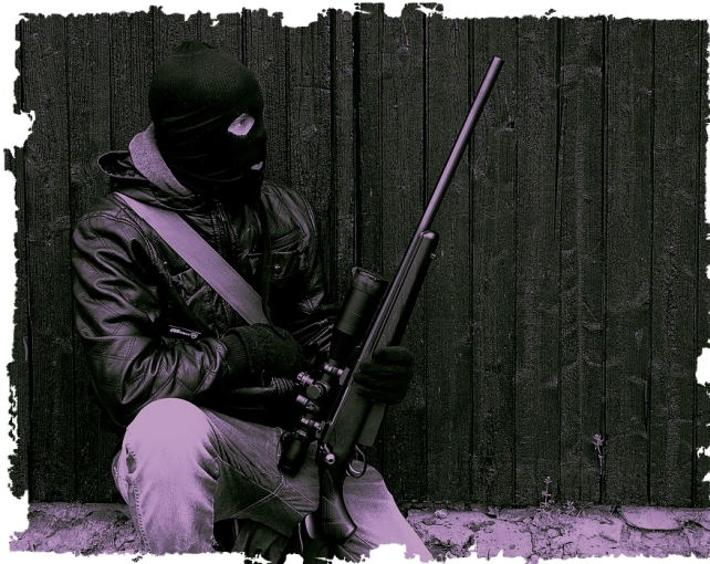
Table 6: The Mercenary

A mercenary gets two extra items in character creation, which must be taken from the Melee Weapons, Ranged Weapons or Armour lists.