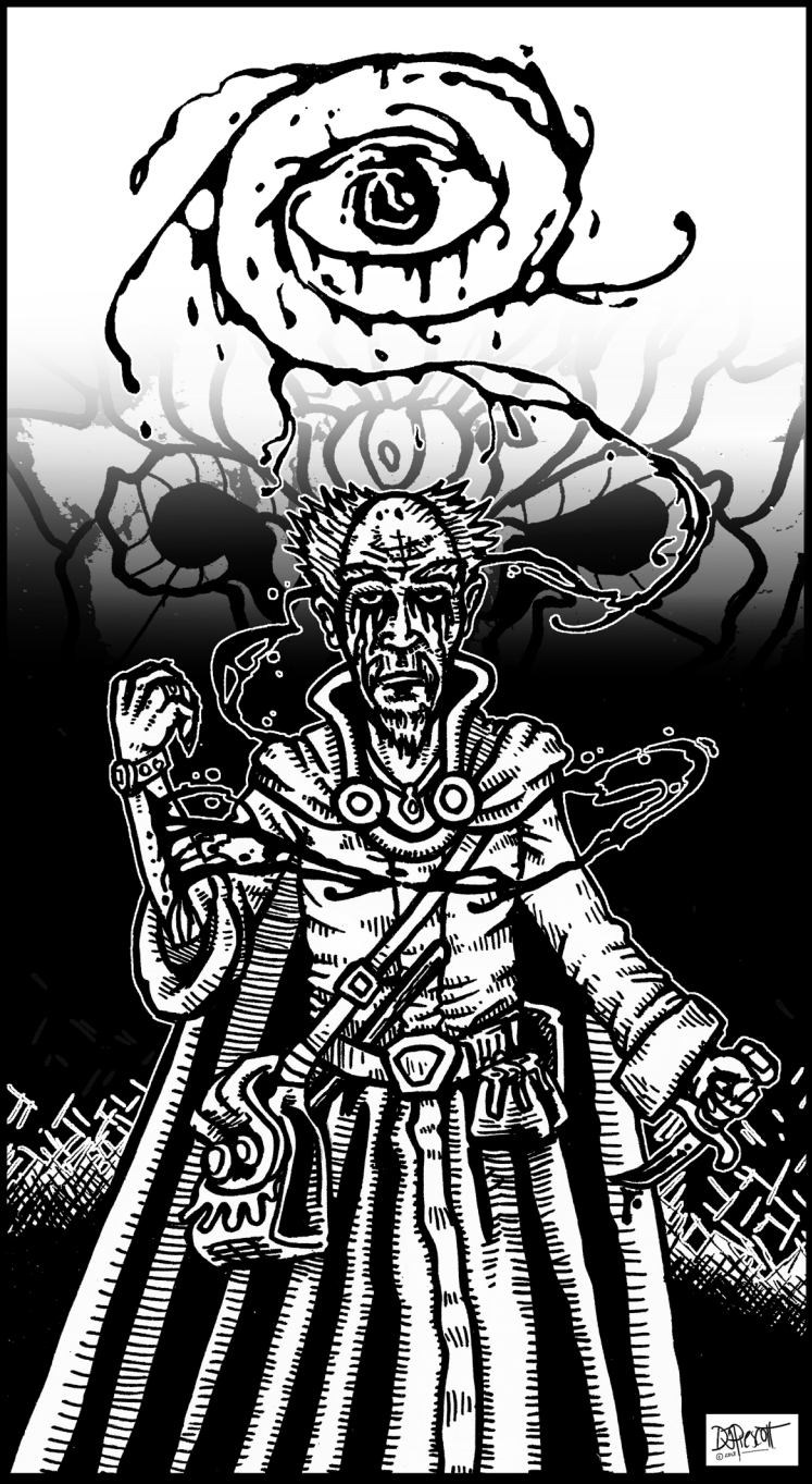
Illustration By Danny Prescott