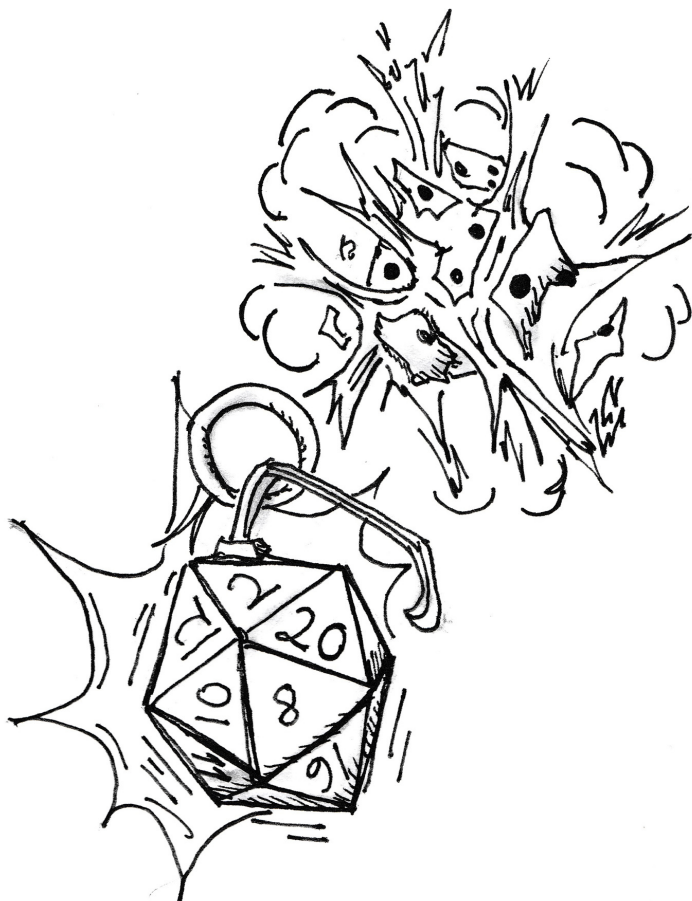
Illustration By Clayton Williams

Note: The weapon die does not “explode” if a maximum roll is achieved. Once all the dice are rolled, combine all the results and consult the table below.