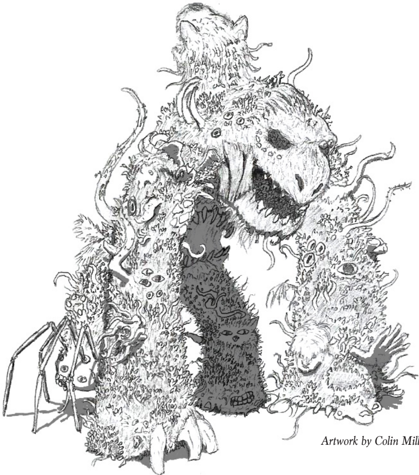
Artwork by Colin Mills

The caster creates a 100' radius zone of madness, provoking all living creatures within to a mindless frenzy. The zone is centered on the caster, moves with them, and lasts for a number of rounds equal to the CL. Each round, creatures within the zone must attack the nearest living creature with either their natural attacks or the Blood Fang of Culmenthdor. Affected creatures also gain +2 to their attack and damage rolls, and an extra attack that is -1d than their lowest action die. If an affected creature kills another creature, they must spend the remainder of the spell's duration consuming the body of the fallen.