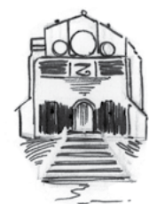
TABLE 4-1: CAROUSING IN LANKHMAR

*Characters from the Eastern Land must choose one of these two languages as their native tongue. A result of "4" when rolling for further additional languages indicates the character also knows the other native language of the Eastern Land.