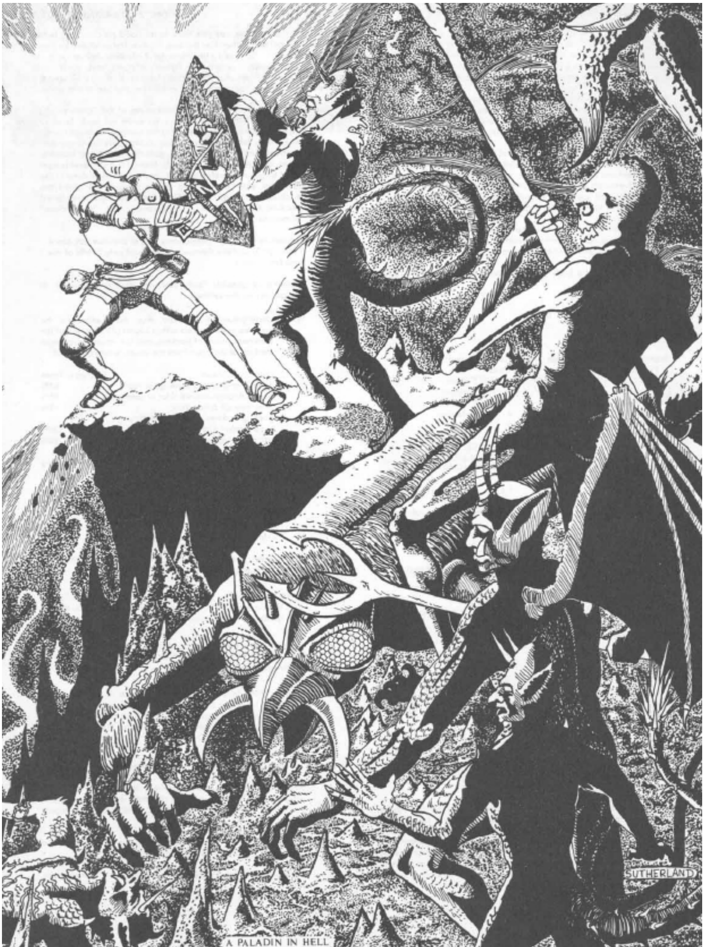
A PALADIN IN HELL