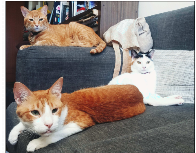
♥ FROM TOP TO BOTTOM: MERLIN (THE MASTERMIND), CASSANDRA (THE HALF CAT), AND CHASSIS (THE POLITE CAT) ♥