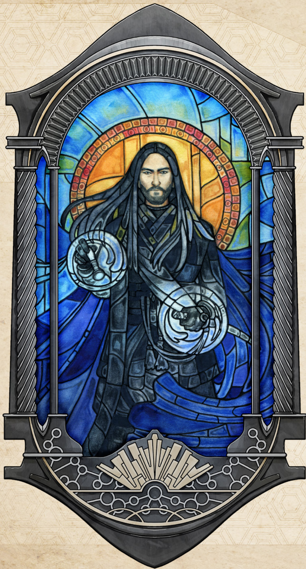
Saint Lextius the Knight