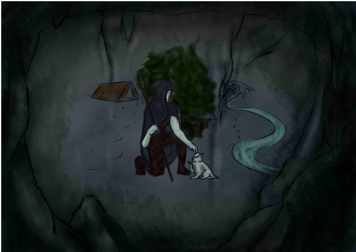
FIGURE 1: NORTH WALL