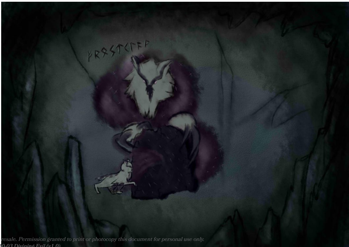
FIGURE 2: SOUTH WALL