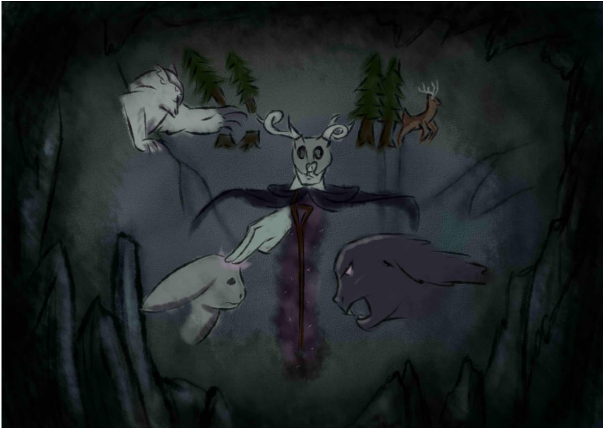
FIGURE 3: EAST WALL