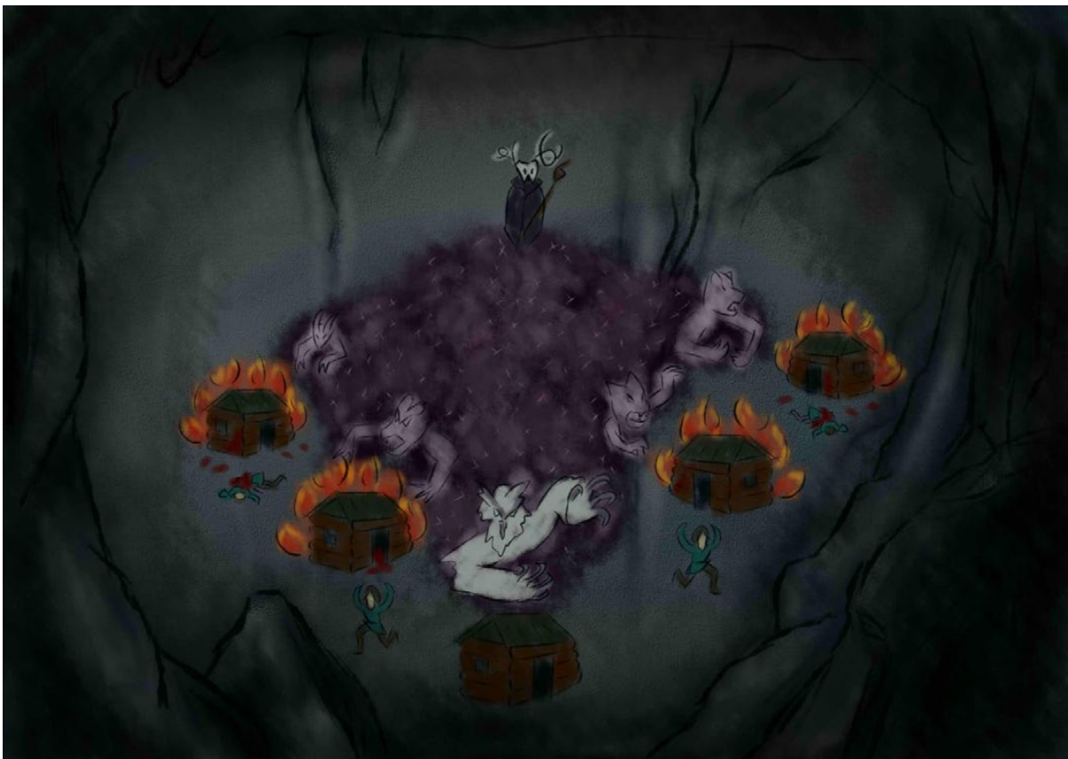
FIGURE 4: WEST WALL