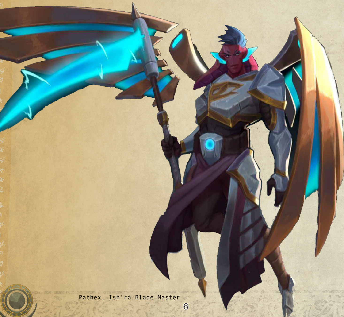
Pathex, Ish'ra Blade Master

LEARN MORE AT WWW.STORMBUNNYSTUDIOS.COM/ALESSIA