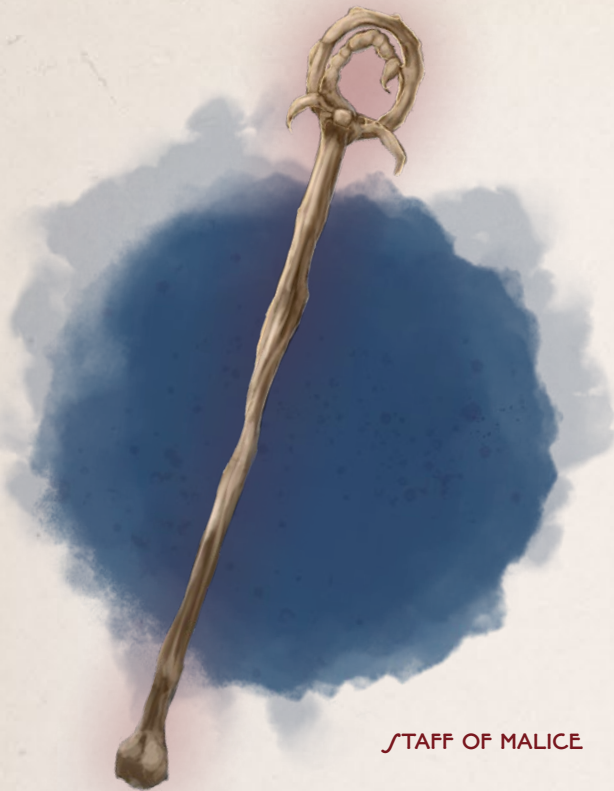
STAFF OF MALICE

Tyrant's Magic. While you are holding this weapon, you can use an action to cast the following spells from it, using your spell save DC: blur , fly , hold monster , finger of death , and mystic lash PH . Once you cast a spell in this way, you can't cast that spell from the weapon again until the next dawn.