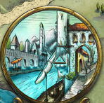
The Flourished Flag inn is a popular destination for fired sailors