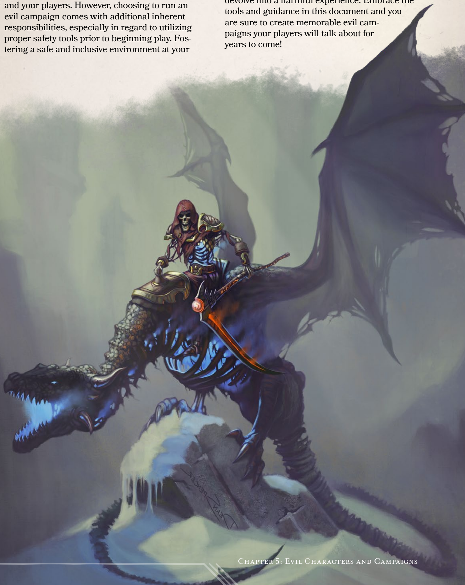
table is essential to running evil campaigns. Without these safety tools and proper respect for everyone at the table, the evil campaign can devolve into a harmful experience. Embrace the tools and guidance in this document and you are sure to create memorable evil campaigns your players will talk about for years to come!

There is nothing wrong with running evil campaigns, and they can be fun for both you and your players. However, choosing to run an evil campaign comes with additional inherent responsibilities, especially in regard to utilizing proper safety tools prior to beginning play. Fostering a safe and inclusive environment at your