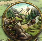
Goblin raiders ambushing a caravan on Dusk Road