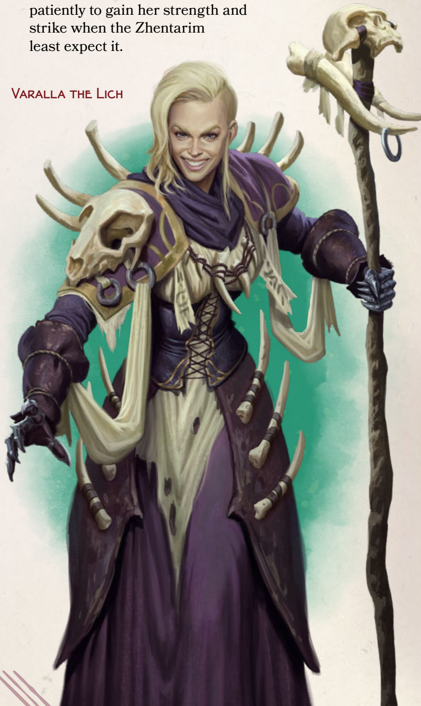
VARALLA THE LICH

Dark Vengeance. Consumed by hatred for Fzoul and Manshoon, Varalla has made it her quest to restore herself as ruler of Darkhold. Varalla is manipulating Ordeah as she waits patiently to gain her strength and strike when the Zhentarim least expect it.