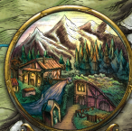
The Village Mill