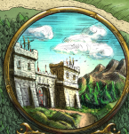
Powerful ballistas on the sturdy battlements