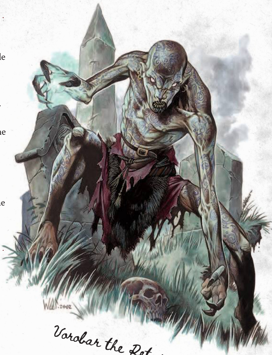
Varobar the Returned

Spew Retchling. The ghost vomits forth the contents of its stomach, creating a retchling (use the statistics for a crawling claw , MM 44) in a space up to 10 feet away from the ghost. The retchling acts on the ghosts turn. The ghost must use its Consume Flesh Legendary Action before creating another retchling.