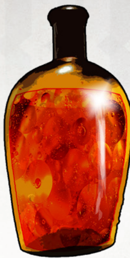
Fire Beetle Potion

When you cast a spell that causes fire damage you may use the flame rose to infuse power into the spell causing the targets of the spell to catch fire and take an additional 5 fire damage at the start of their next turn. The flame rose is consumed during the casting of the spell, erupting into a small burst of fire.