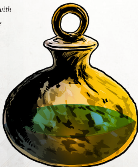
Elixir of Accuracy with decorative bottle