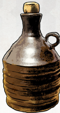
Jug of Astral Mead, 2 pint container (2000 gp as pictured).

This clay is mined from the Elemental Plane of Earth, bringing the resilience of the element of earth to your creations.