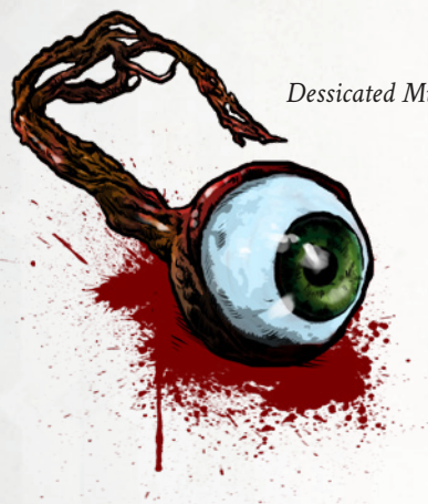
Desiccated Mummy's Eye