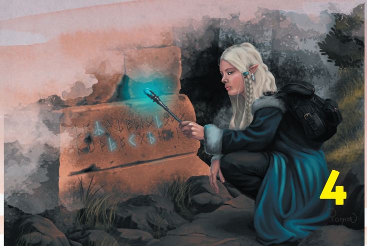
a DOZEN WANTED CRIMINALS • Page 14

There is no misunderstanding or confusion here. Sylar is a thief and a liar, and she is very likely trying to sell the stolen goods right now at some nearby town or to strangers that she may meet on the road.