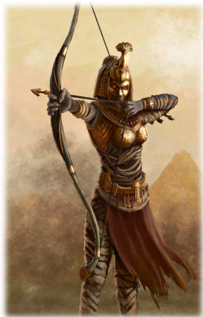
Illustration by Uriak