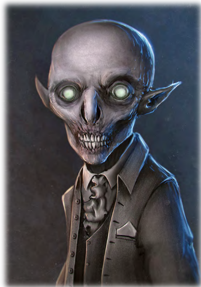
Illustration by Marius Siergiejew