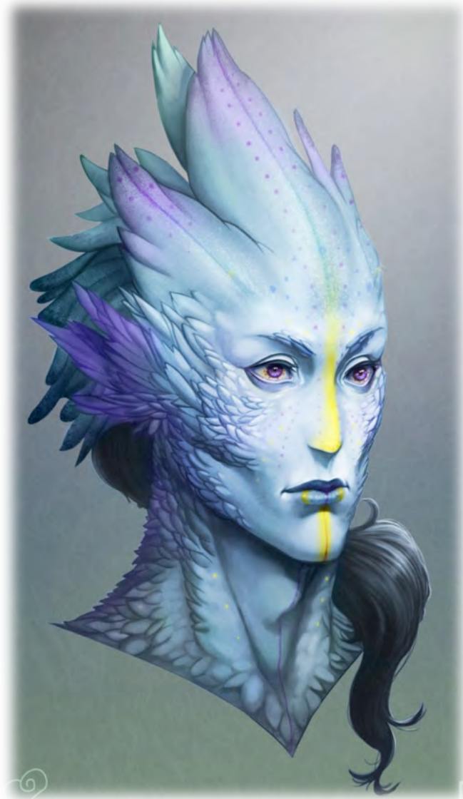
Illustration by Ama & Nova