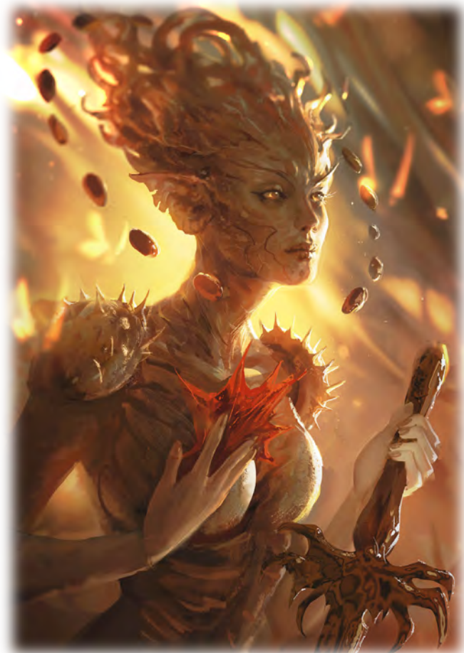
Illustration by Sandra Duchiewicz