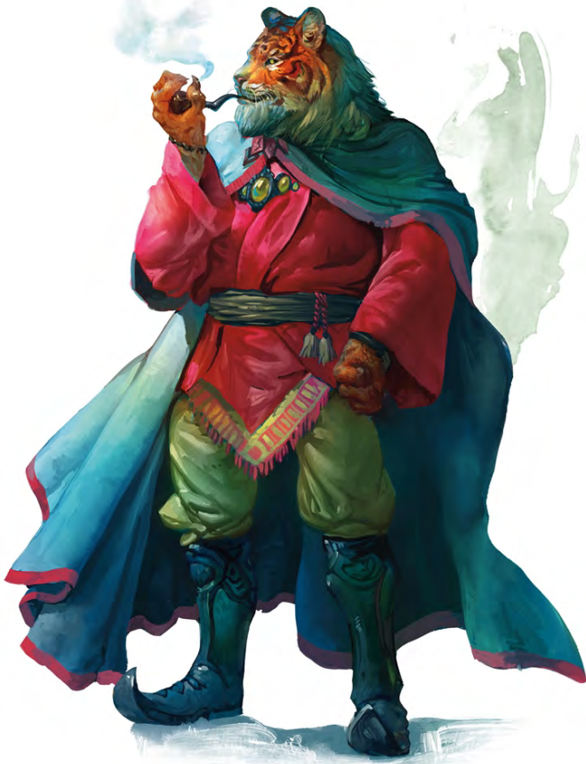
Illustration from the Monster Manual