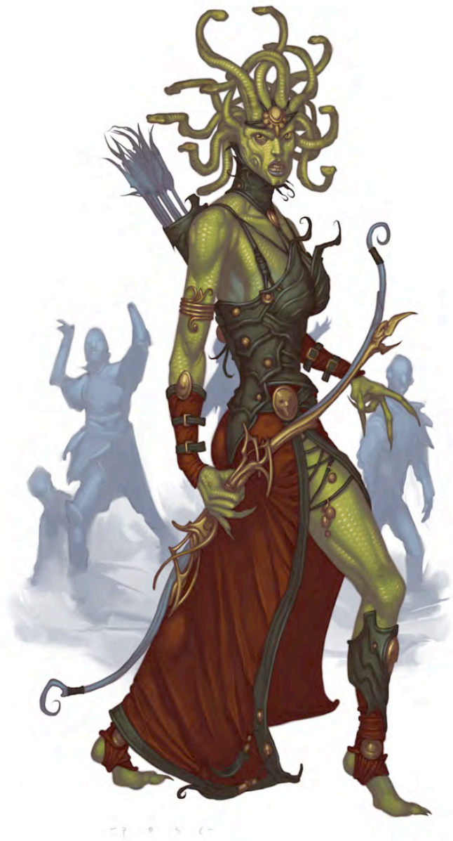
Illustration by R.K. Post