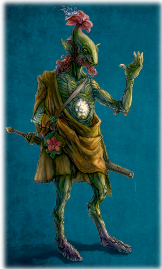
Illustration by Jan Pospisil