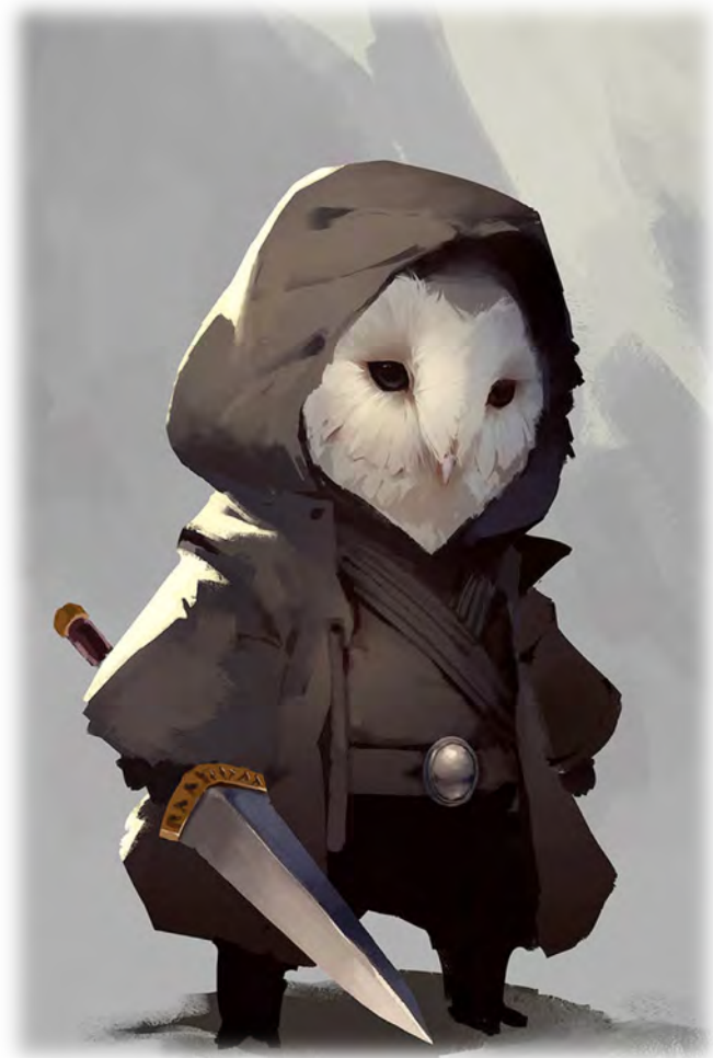
Illustration by Son Trinh