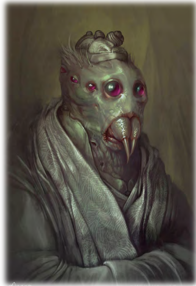
Illustration by Apertus