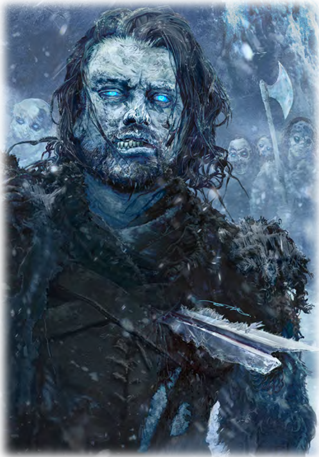
Illustration by Ertaç Altınöz