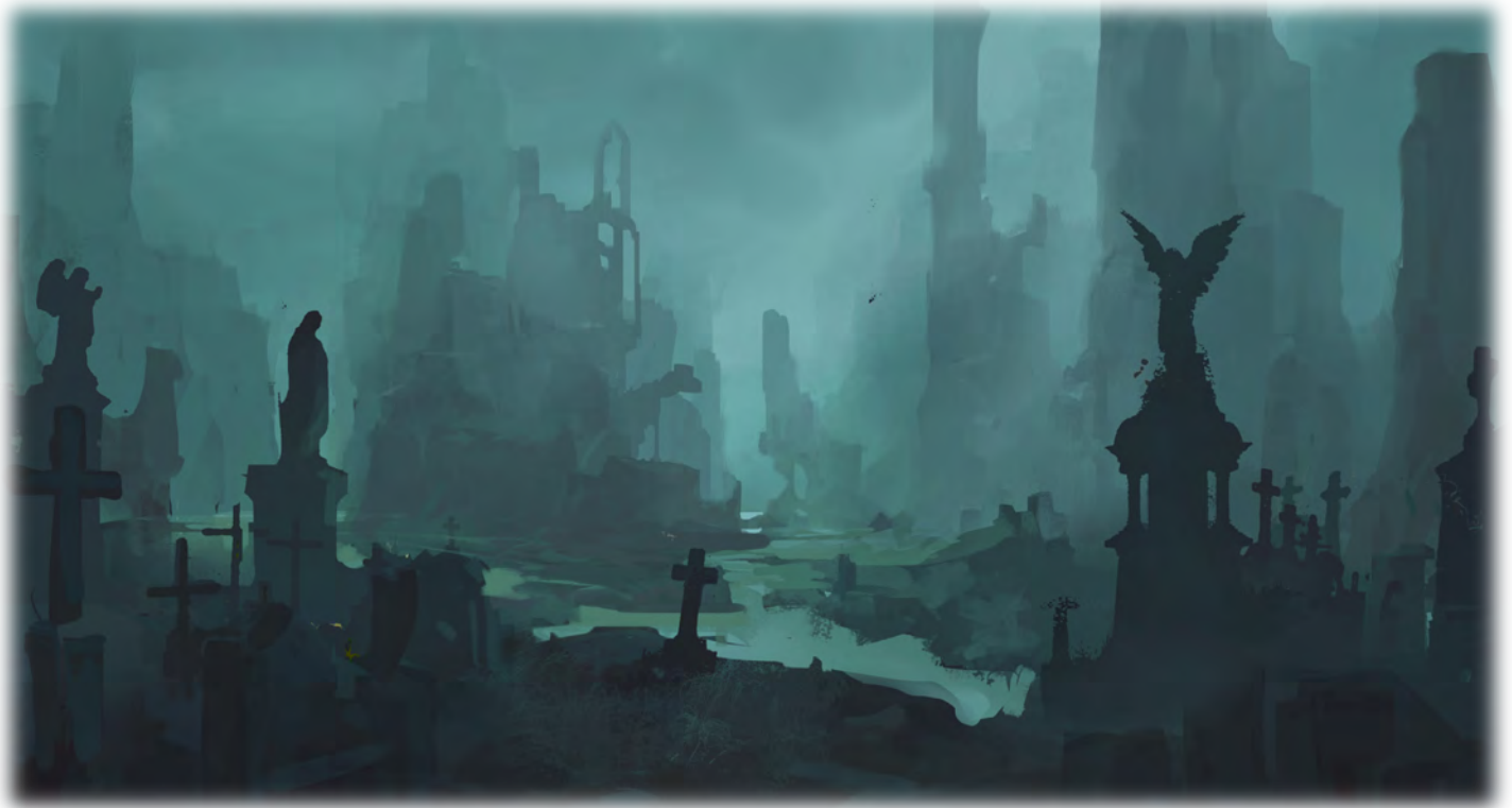
Illustration by Jean-Guilhem Barguès