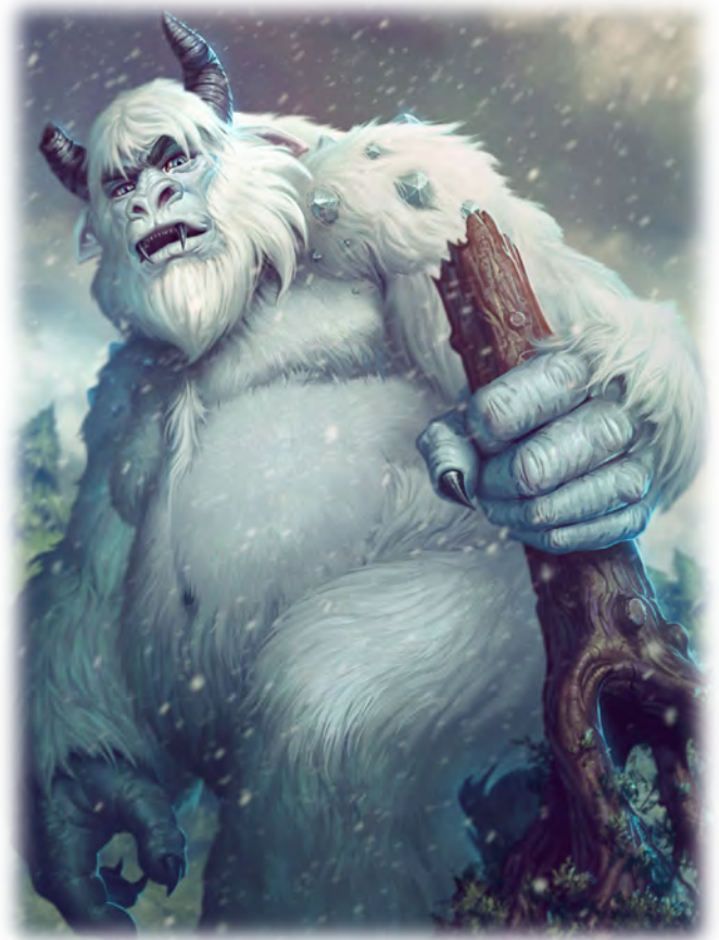
Illustration by Jon Neimeister

Subrace. Choose one of the following subraces: Yeti , or Sasquatch .