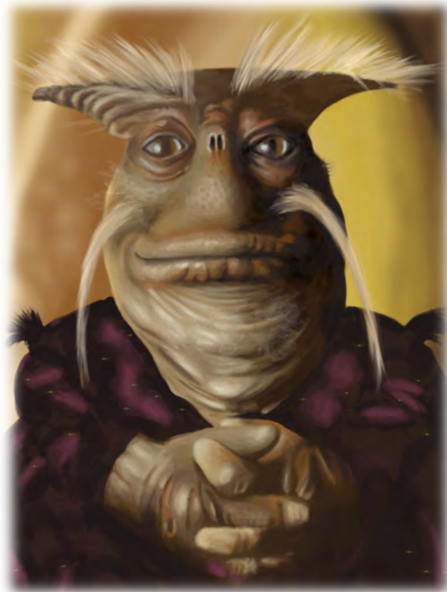
Illustration by Kristy