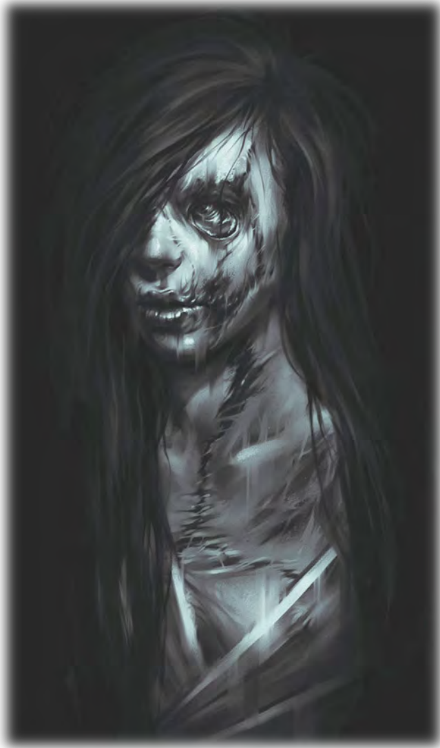
Illustration by Antarctic Spring