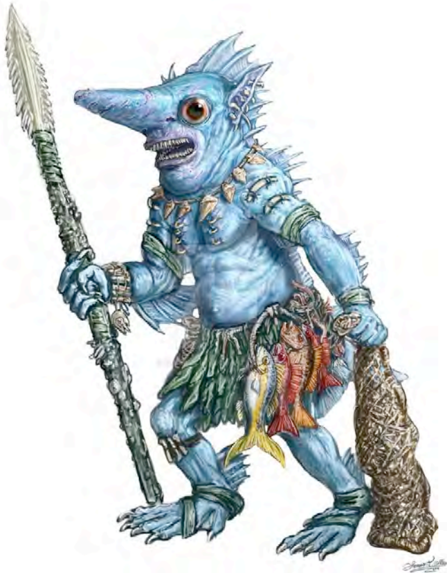
Illustration by James Olley