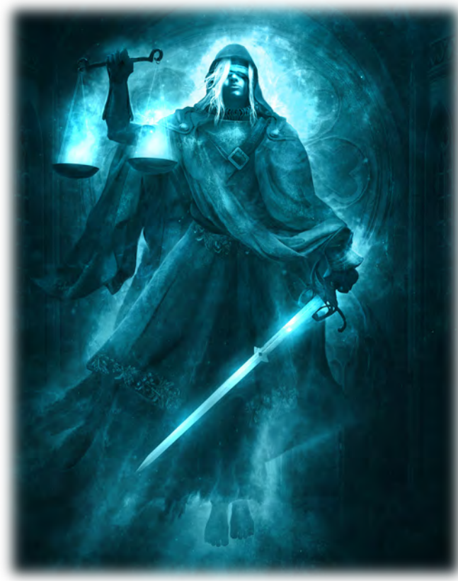
Illustration by Guillem H. Pongiluppi