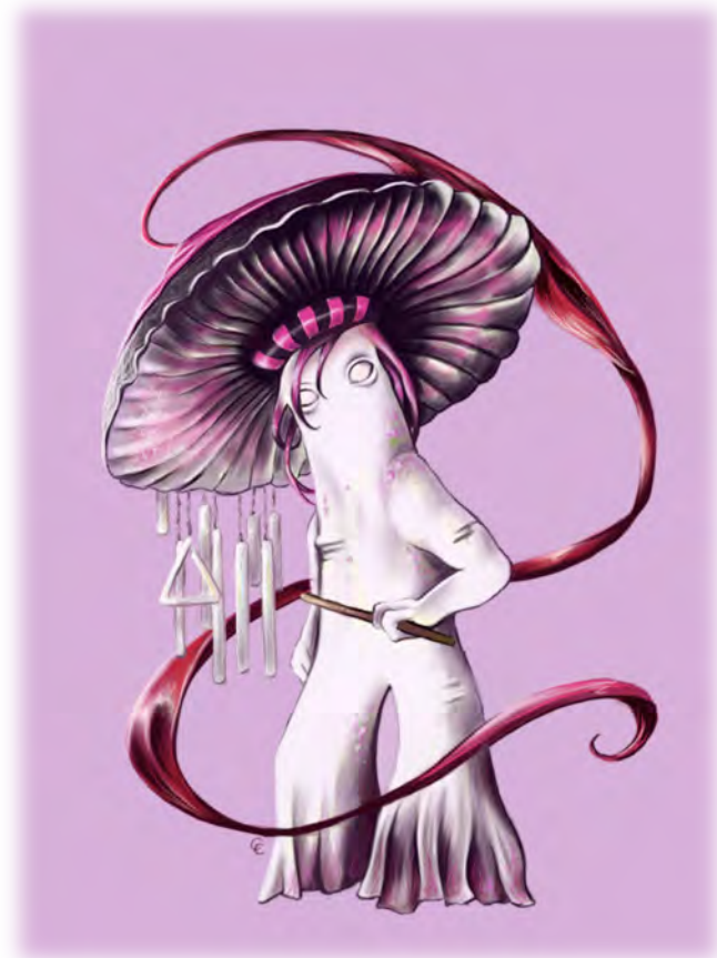
Illustration by Cecelia Collette