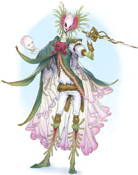
Illustration by Rich Carey