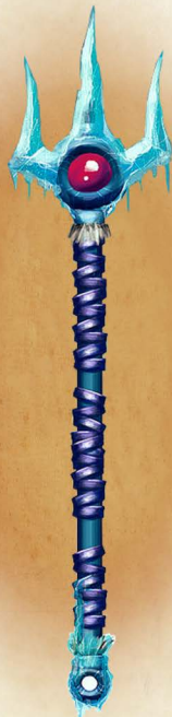
True Ice Trident