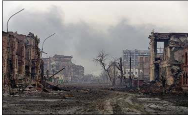
Australian, New Zealand and South Pacific Nations UN Enclave, Augsberg, Germany, 2000

A stranded UN composite unit in Germany, suitable for Southern Pacific characters.