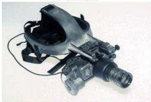
A N/PVS-7 (NATO)

Return to Main Page Revised Equipment listings. IR Goggles: