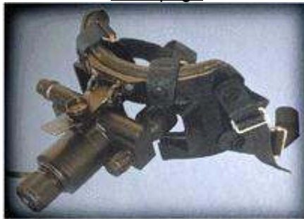
Kollibri Orion 8 (Warsaw Pact)

New Equipment and changes to out of date descriptions. Return to Twilight 2000 main page