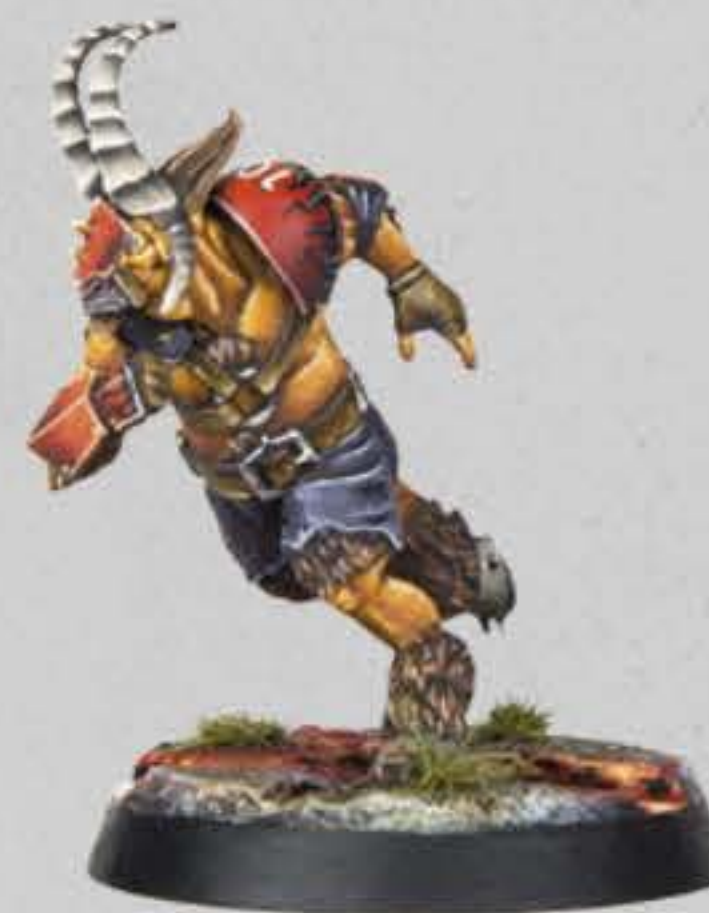
MASHER THICKSKULL BEASTMAN RUNNER, DOOM LORDS