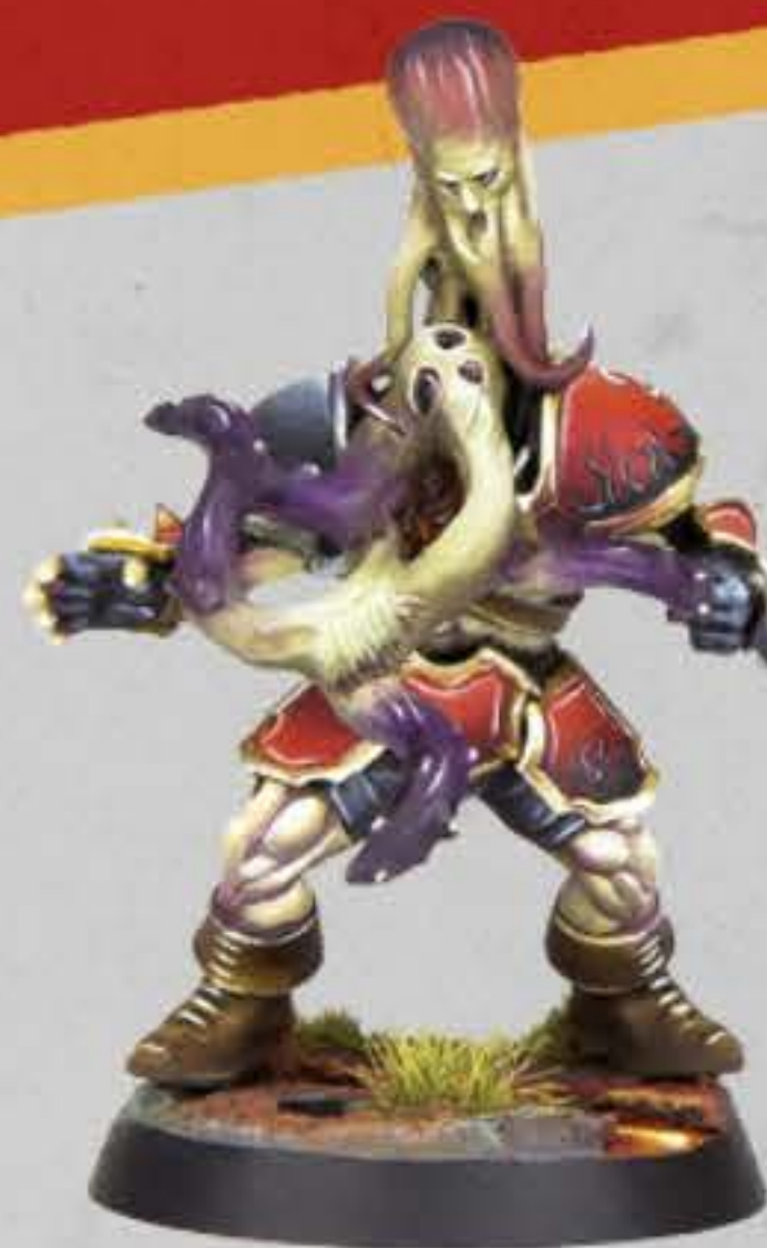
SHARKEY MUTATED CHOSEN BLOCKER, DOOM LORDS