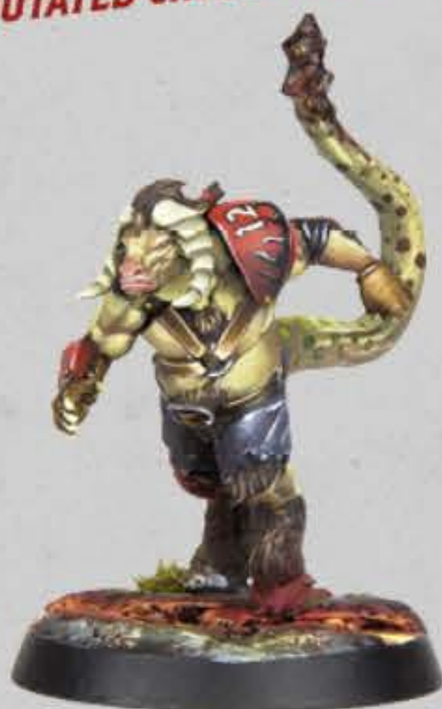
RAZORHORN MUTATED BEASTMAN PLAYER, DOOM LORDS