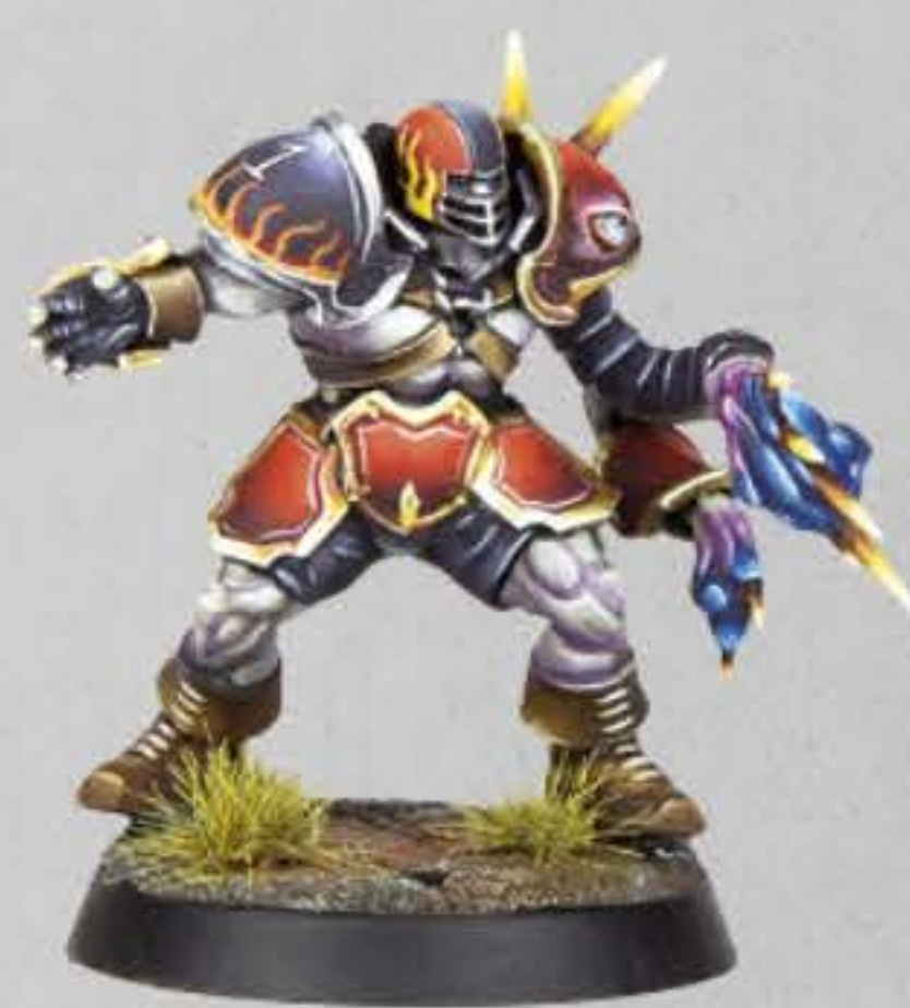
DUMBGUCK MUTATED CHOSEN BLOCKER PLAYER, DOOM LORDS

The six players presented here have been converted using bits from the Citadel Chaos Spawn kit to represent their mutations.