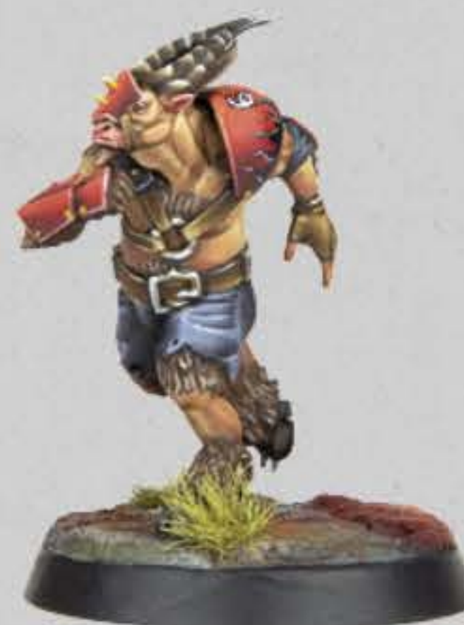
LOW-BLOCK TANGLEHORN BEASTMAN RUNNER, DOOM LORDS