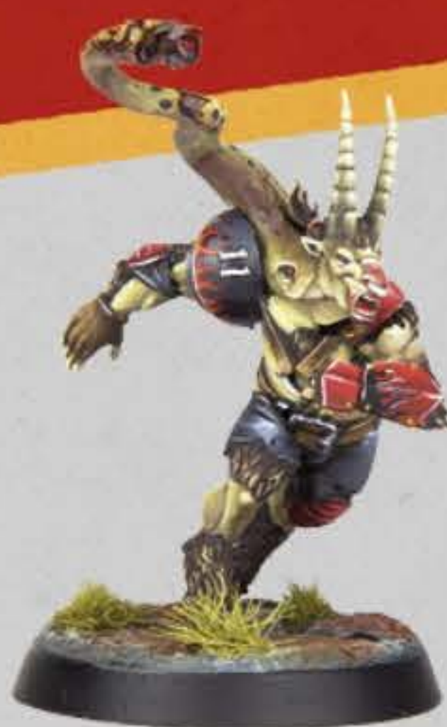
DIETER FRUNCH MUTATED CHOSEN BLOCKER, DOOM LORDS