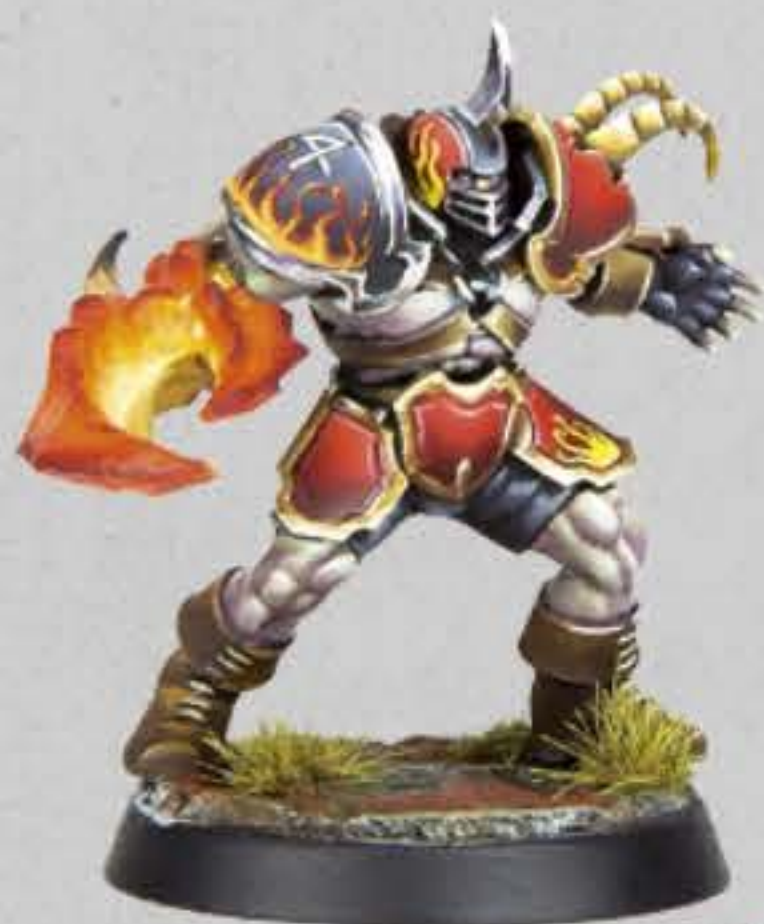
ROT T. WEILER MUTATED CHOSEN BLOCKER, DOOM LORDS