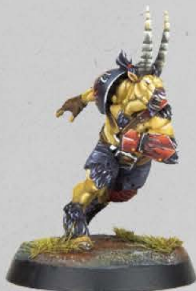
RAMSTEIN HARDHOOF BEASTMAN RUNNER, DOOM LORDS