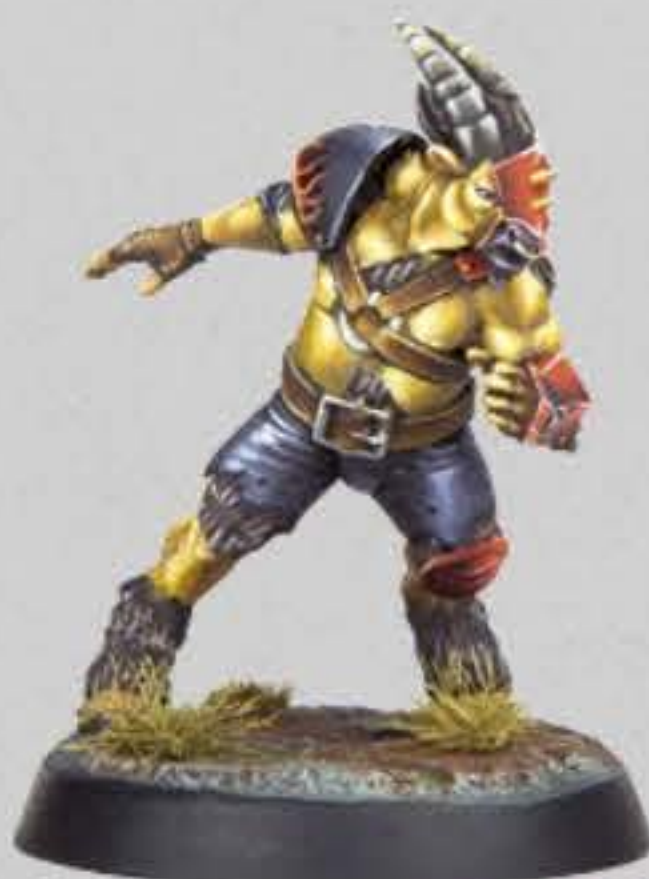
PACKMASTER PUK BEASTMAN RUNNER, DOOM LORDS