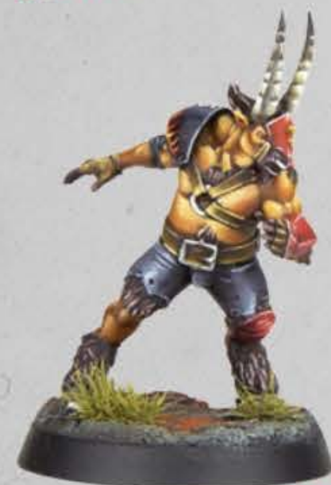
DARKHIDE DOUBLEDOWN BEASTMAN RUNNER, DOOM LORDS

© Copyright Games Workshop Limited 2018. Blood Bowl, Blood Bowl The Game of Fantasy Football, Citadel, Games Workshop, GW and all associated logos, names, races, vehicles, weapons and characters are either ® or TM and/or © Games Workshop Limited. All Rights Reserved.