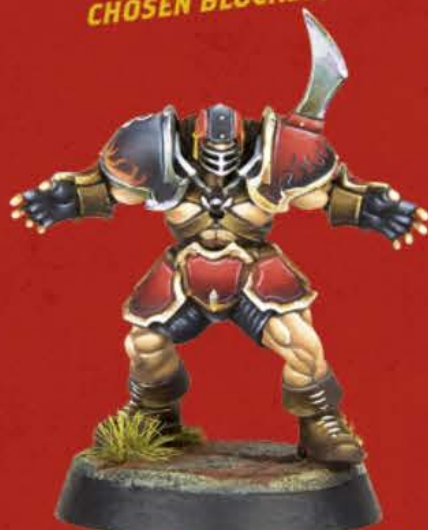
'SHADY' DA'ARK HELM CHOSEN BLOCKER, DOOM LORDS