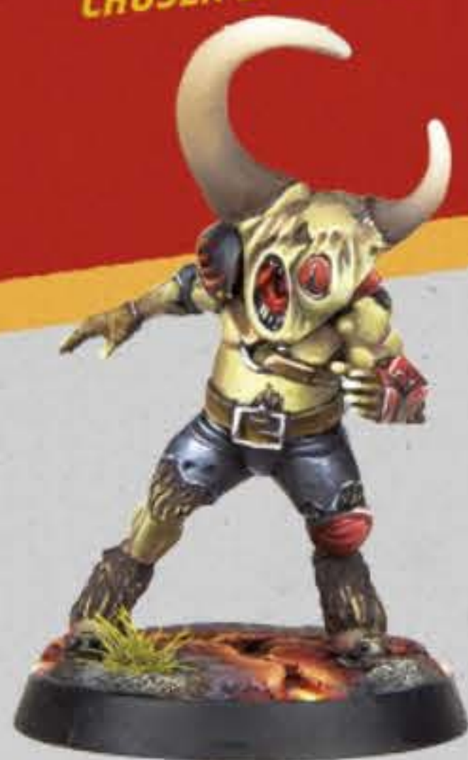
SKULLFACE MUTATED BEASTMAN PLAYER, DOOM LORDS