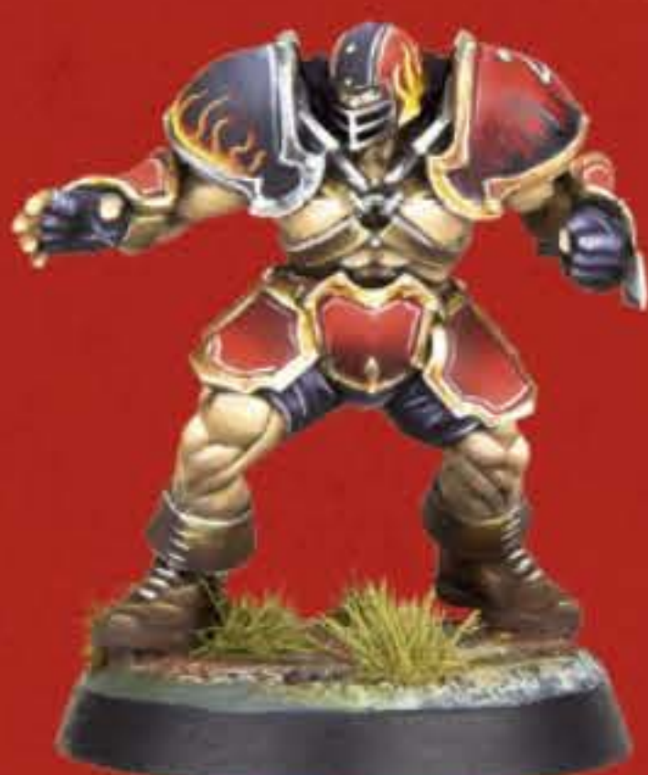
EYGOR GORELUST CHOSEN BLOCKER, DOOM LORDS