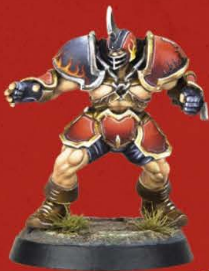
DAVE THE MERCILESS CHOSEN BLOCKER, DOOM LORDS