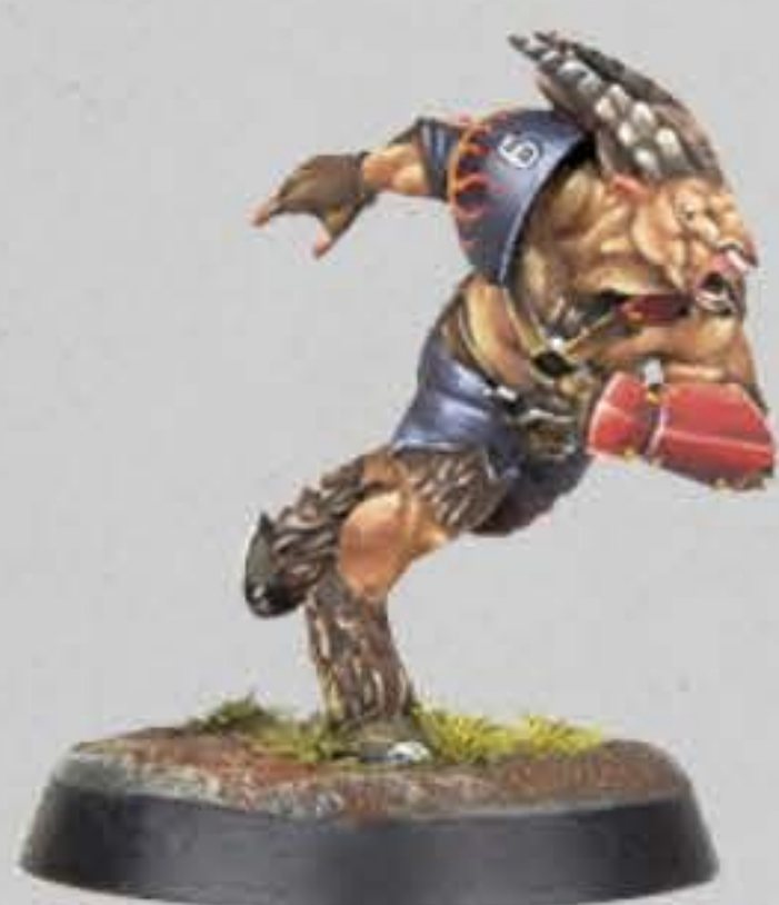
BLACKLEG MARROWSUCKER BEASTMAN RUNNER, DOOM LORDS