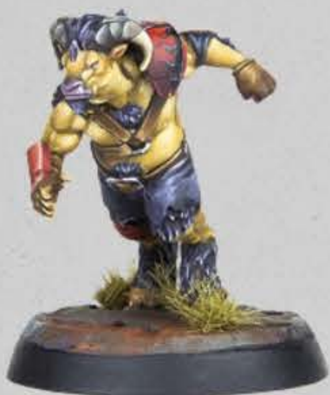
WHACKER WHITEFACE BEASTMAN RUNNER, DOOM LORDS