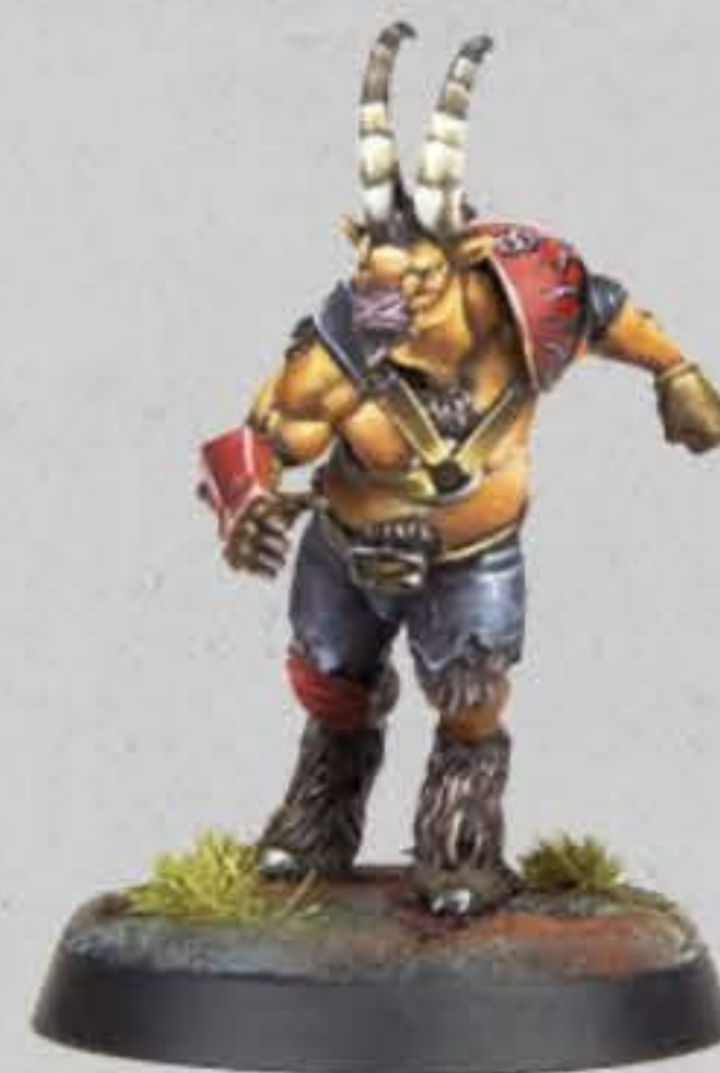
STRONGHOOF SPITTEDROOL BEASTMAN RUNNER, DOOM LORDS

Order now and receive a unique gift – Lord Borak Book Tour Edition, showing the legendary Star Player signing the flayed skin of his fans to their delighted screams.