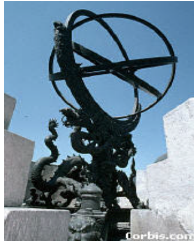
Image 2 - Armillary

months or with two Qin/Porcupine months in the Zhongguo calendar. This is the time of the most inauspicious period as it represents chaos and usurpation of order. Spies and security are put on extra alert during this time to watch for any rebellion. Some said that it was during a doubled Qin/Porcupine month when the Zhou Dynasty overthrew the Quan Dynasty.